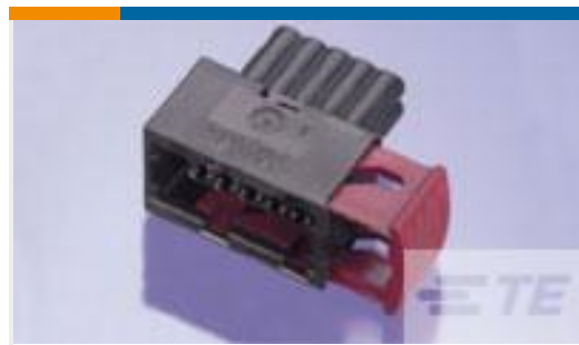
TE Part # 2-1452319-1 JPT HOUSING SEAL 6P