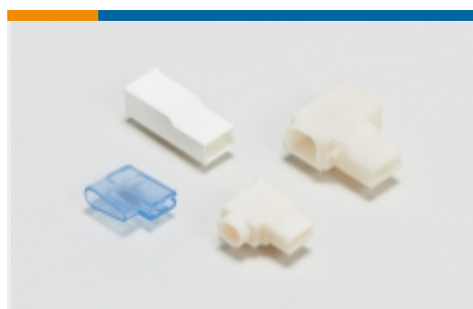
Crimp Terminal Housings(13)