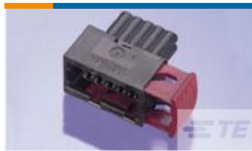
TE Part # 1-963212-9 6P J-P-T GEH KOMPL