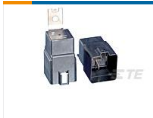
TE Part #1-1414121-0 V23136B1001X051-EV-CBOX