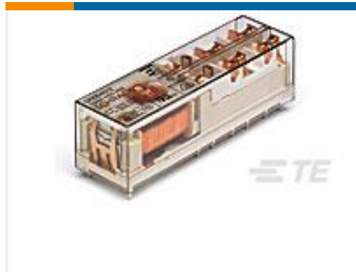
TE Part #6-1415537-3 SR6A6K18