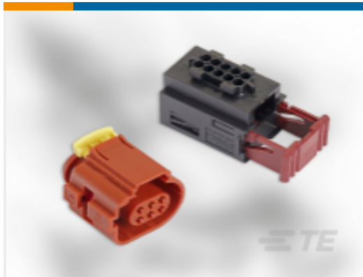
TE Part #2-962349-1 TIMER, CONNECTOR HOUSING