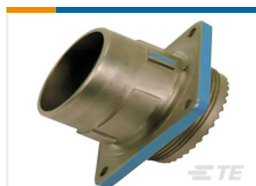
TE Part #YDIV46E25-19PNC128 PLUG ASSY