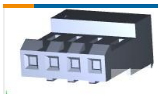
TE Part #3-641150-4 04P MTA156 ASSY 22AWG RED LF