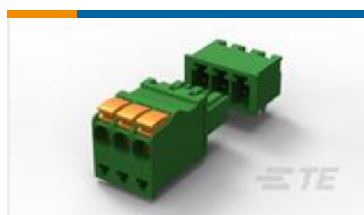
TE Part #1-1986692-0 STR PLUG SPRING TYPE RH 10P, 3.50 mm