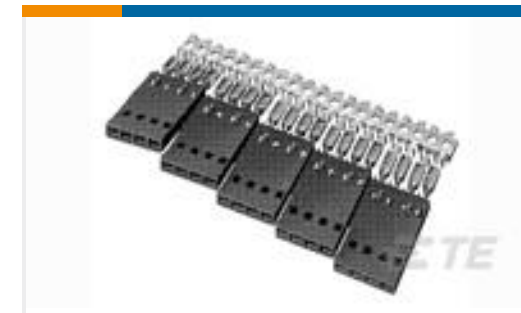
TE Part # 103972-3 5X4 MTE RCPT SR RIBBED .100CL