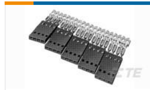
TE Part # 103969-3 5X4 MTE RCPT SR RIBBED .100CL