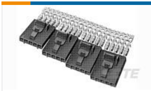
TE Part # 103957-3 5X4 MTE RCPT SR LATCH .100CL