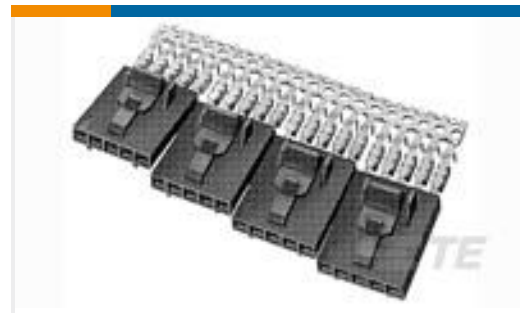
TE Part # 103960-3 5X4 MTE RCPT SR LATCH .100CL