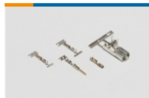
Wire-to-Board Connector Contacts(32)