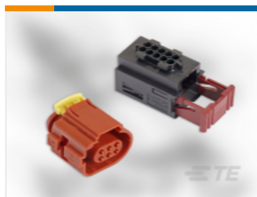
TE Part #1-965640-1 TIMER, CONNECTOR HOUSING