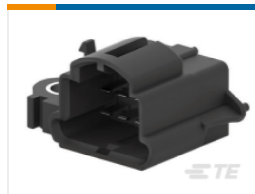
TE Part # CAT-LMPH9507 LOW & MEDIUM POWER HEADER