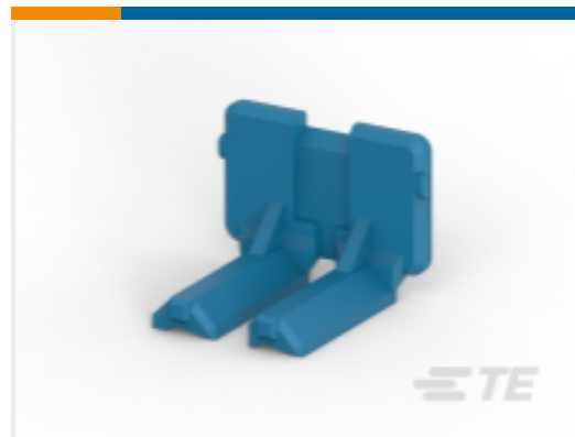
TE Part # 968271-1 2. KONT-SICHERUNG 6P