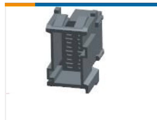
TE Part # 1-965641-1 FLACH-STE-GEH2,8 6P