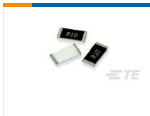
TE Part #2176055-1 RLP73V 2B R010 1% 1K RL