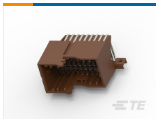
TE Part # CAT-M4599-H342 AMP MCP UNSEALED HEADERS