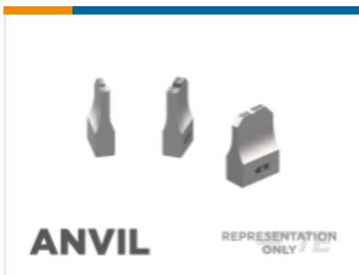
TE Part #3-1633932-2 ANVIL, COMBINATION