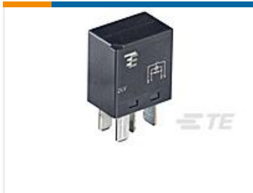
TE Part #6-1393292-2 V23074A2002A402-SZ-CBOX