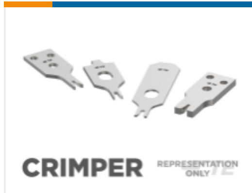
TE Part #2-1633966-3 CRIMPER,INSULATION O