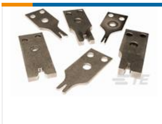
TE Part #6-456402-5 CRIMPER, WIRE .055 "F"