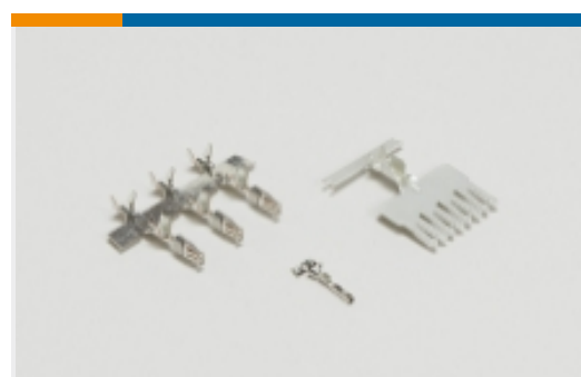
Busbars & Terminals(1)