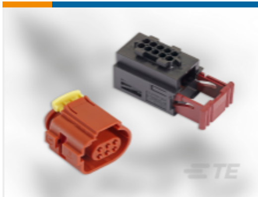
TE Part #1-967281-1 TIMER, CONNECTOR HOUSING