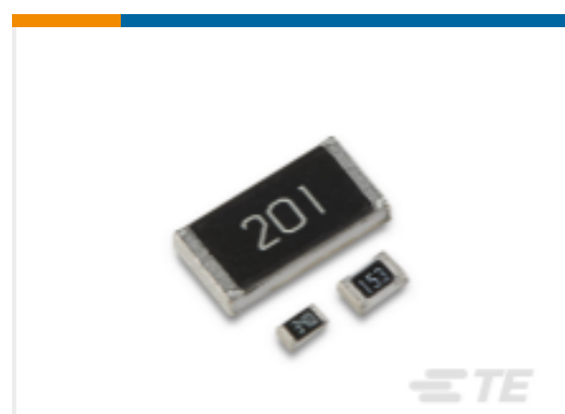
TE Part #2176326-2 CRGP 0603 12R 1%