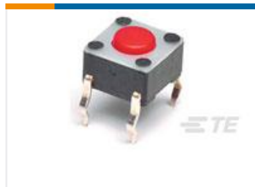
TE Part #1-1825910-0 FSM6JH=6MM TACT SWITCH, HIGH TEMP