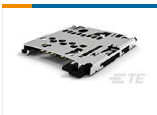
TE Part #2201778-1 MICRO SD PUSH PUSH LOW PROFILE TYPE