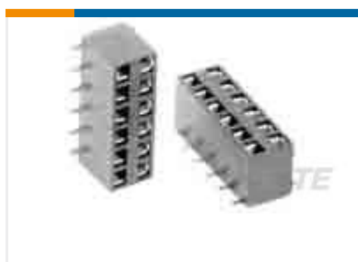
TE Part #969973-6 2x6P HV100 REC. CON, SMD, GOLD, BLISTER