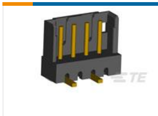
TE Part #292172-8 CT POST HDR ASSY 8P IN-TUBE BL