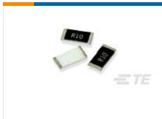
TE Part #2176052-6 RLP73M 1J R082 5% 5K RL