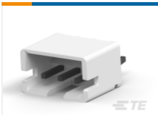
TE Part #1-1775469-0 AMP HPI 2.0MM HEADERS