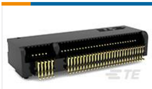
TE Part #1-2199230-6 M.2 0.5PITCH 4.2H KEY M 30U AU