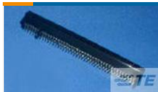
TE Part #5145154-4 STANDARD EDGE .050 SERIES 60 DUAL ASSY