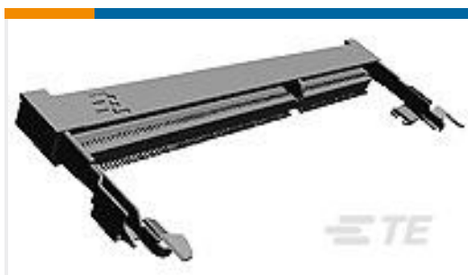
TE Part #2-2013310-1 EMBOSS TAPE DDR3 204P 9.2H STD