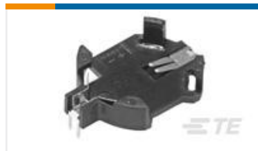
TE Part #120591-1 TOP LOAD BATTERY