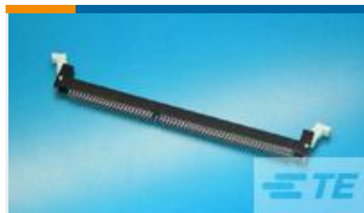
TE Part #1-1932000-1 VERTICAL DDR3 DIMM, 240 POSITION