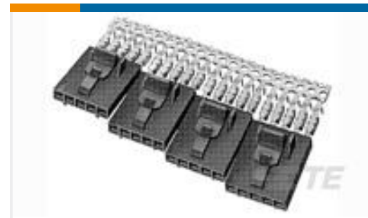
TE Part # 103960-4 4X5 MTE RCPT SR LATCH .100CL