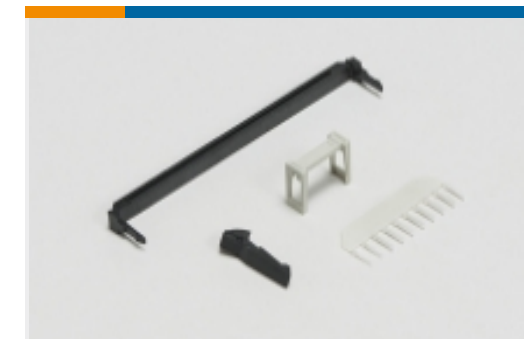
Ribbon Connector Accessories(1)