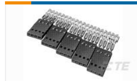
TE Part # 103969-4 4X5 MTE RCPT SR RIBBED .100CL