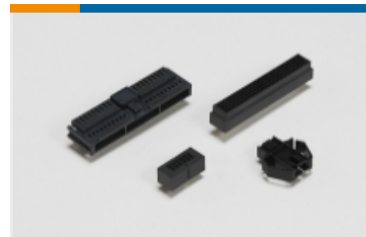
PCB Connector Shrouds(40)