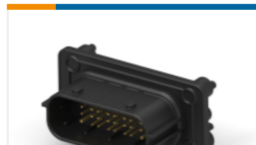
TE Part #SRK15MDA32A001G003 HDR, 32P, BLK, ST, AU/NI/CU, A