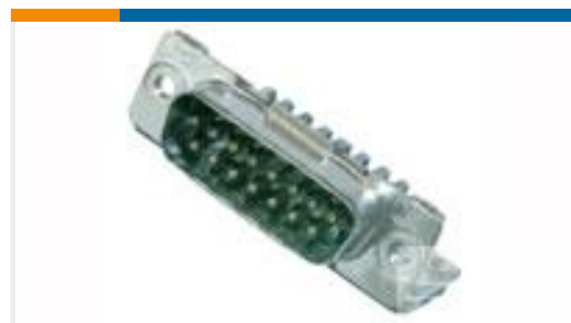
TE Part #5-338169-2 15P HDP20 PLUG ASSY