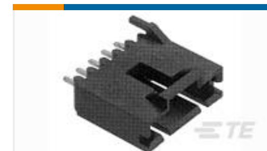
TE Part #104809-6 07 MTE HDR SRST LATCH W/HLDWN