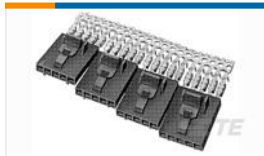
TE Part # 103957-4 4X5 MTE RCPT SR LATCH .100CL