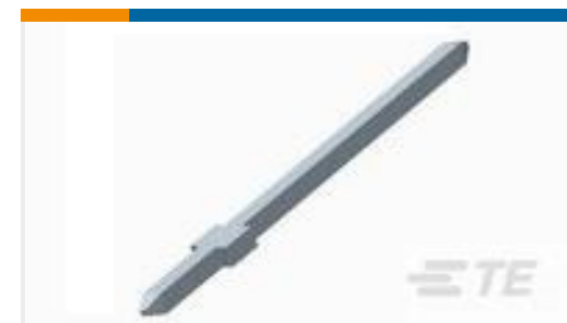
TE Part #1-928776-3 MOD2 STIFT M A-PIN