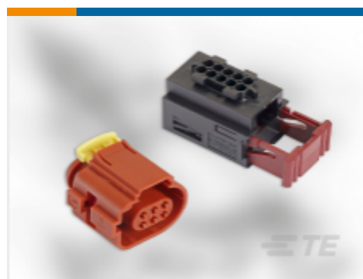
TE Part #1-967623-5 TIMER, CONNECTOR HOUSING