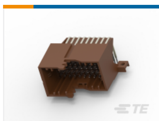
TE Part # CAT-M4599-H342 AMP MCP UNSEALED HEADERS