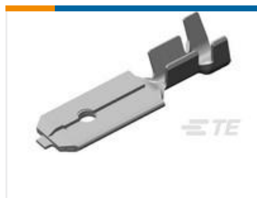
TE Part #626378-1 250 FASTON TAB 18-14 AWG BR