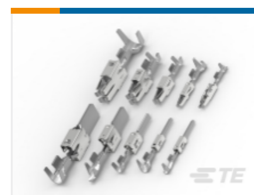
TE Part # CAT-T4827-T273 TIMER, RECEPTACLE AND TAB