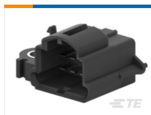
TE Part # CAT-LMPH9507 LOW & MEDIUM POWER HEADER