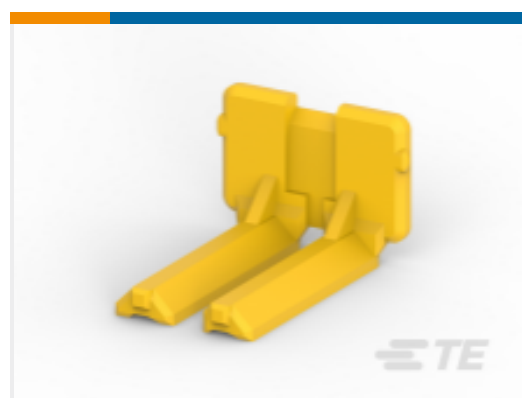
TE Part # 967631-1 2. KONT-SICHERUNG 9P