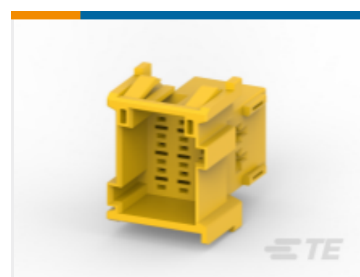
TE Part # 1-967626-1 TAB HOUSING, 2,8MM,9POS.