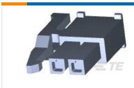
TE Part #2029047-2 2P MICRO MNL RCPT HSG SR SIDE