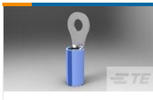
TE Part #2-320561-3 TERMINAL,PIDG R IR 16 6