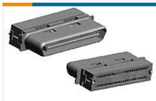
TE Part #5787131-2 36 .8MM CHAMP PLUG KIT