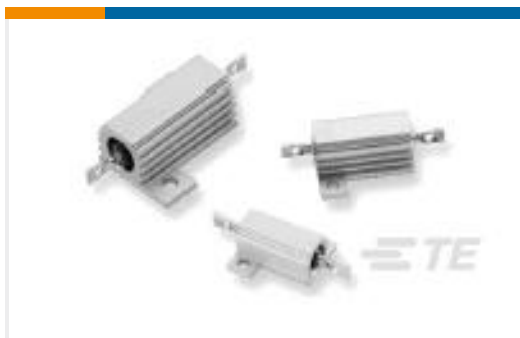
TE Part #1879071-2 THS50 R02 5%