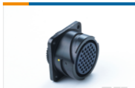
TE Part #Y5015-000000100130 FIXED SOCKET CONNECTOR