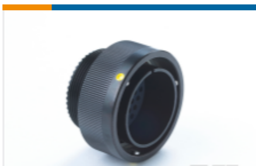
TE Part #Y5015-000000100009 FREE PIN CONNECTOR