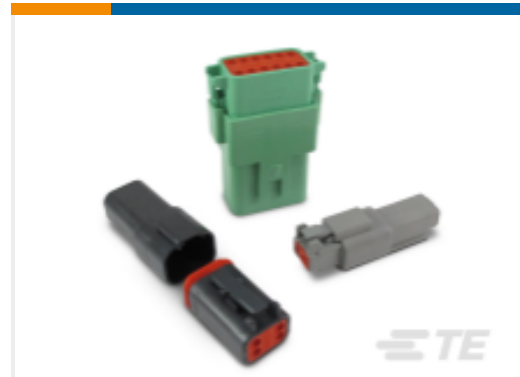
TE Part #DT04-2P DEUTSCH DT Series Housings & Connectors