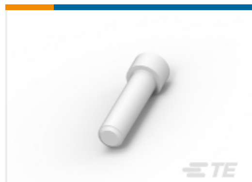
TE Part #114017-ZZ SEALING PLUG, SIZE 12/16, WHT