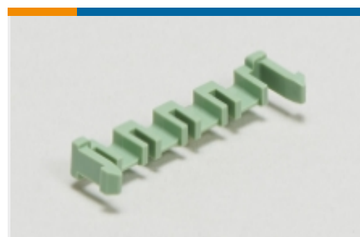
PCB Latches, Locks & Retainers(2)