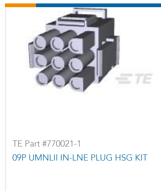
TE Part #770021-1 09P UMNLII IN-LNE PLUG HSG KIT