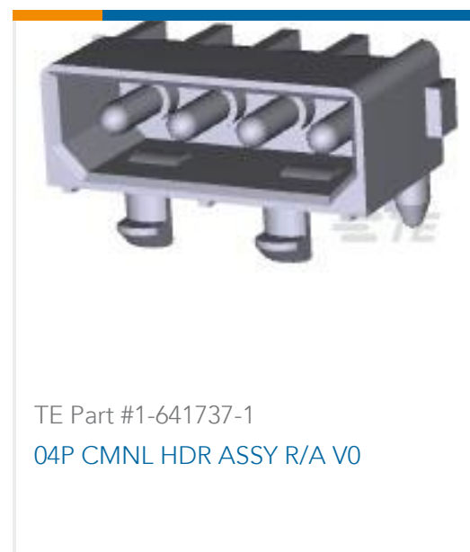
TE Part #1-641737-1 04P CMNL HDR ASSY R/A V0