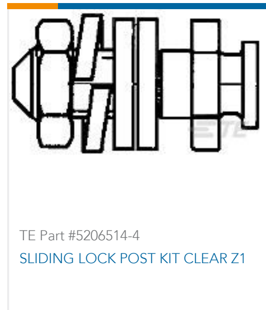
TE Part #5206514-4 SLIDING LOCK POST KIT CLEAR Z1