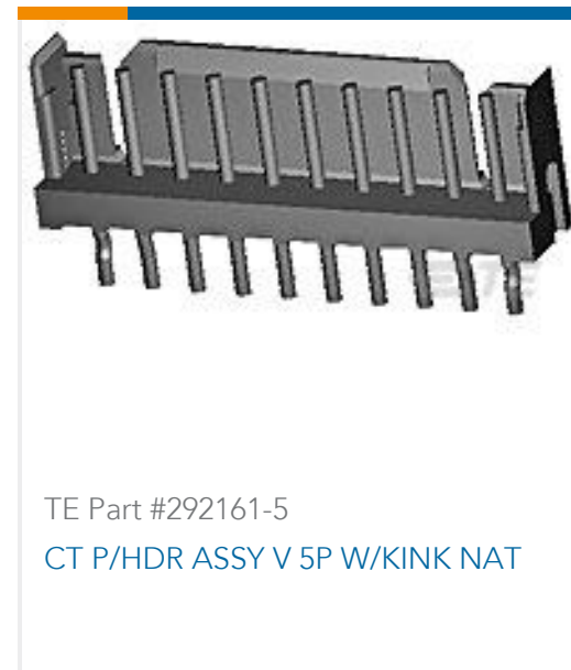
TE Part #292161-5 CT P/HDR ASSY V 5P W/KINK NAT