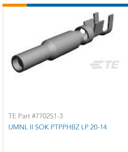
TE Part #770251-3 UMNL II SOK PTPPHBZ LP 20-14