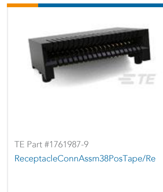
TE Part #1761987-9 ReceptacleConnAssm38PosTape/Re