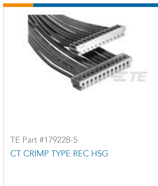
TE Part #179228-5 CT CRIMP TYPE REC HSG