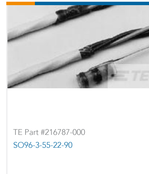
TE Part #216787-000 SO96-3-55-22-90