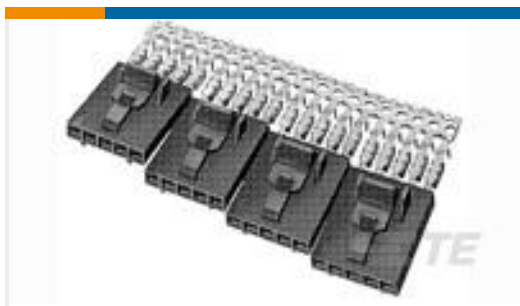
TE Part # 103958-4 4X5 MTE RCPT SR LATCH .100CL