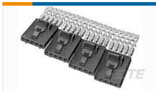
TE Part # 103961-4 4X5 MTE RCPT SR LATCH .100CL