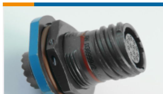
TE Part #YDTS24T21-35SNV001 RECP ASSY