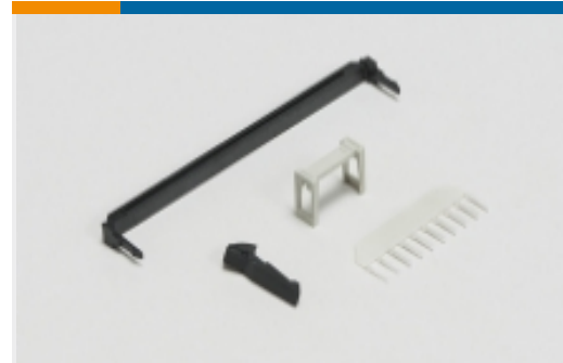
Ribbon Connector Accessories(1)