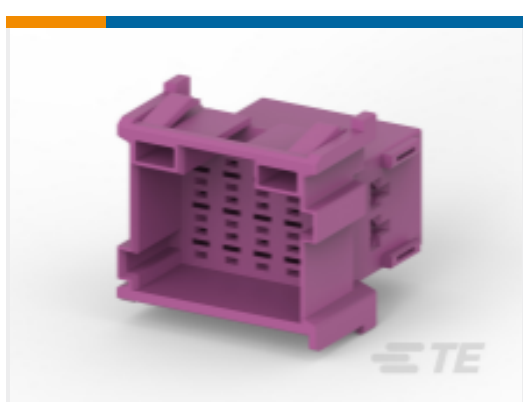
TE Part # 1-967628-1 FLA-ST-GEH 2.8 15P