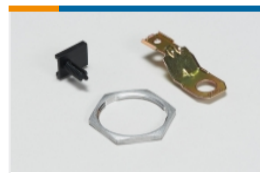
Other Automotive Connector Accessories(1)