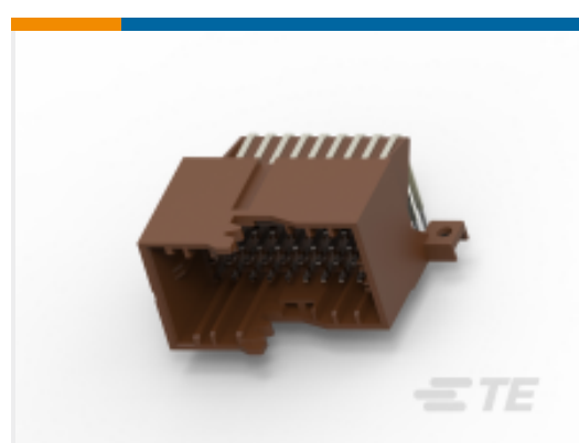
TE Part # CAT-M4599-H342 AMP MCP UNSEALED HEADERS