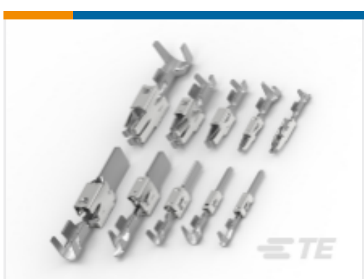
TE Part # CAT-T4827-T273 TIMER, RECEPTACLE AND TAB