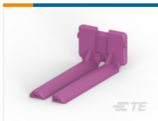
TE Part # 967633-1 2. KONT-SICHERUNG 15P