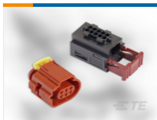
TE Part #3-967624-1 TIMER, CONNECTOR HOUSING