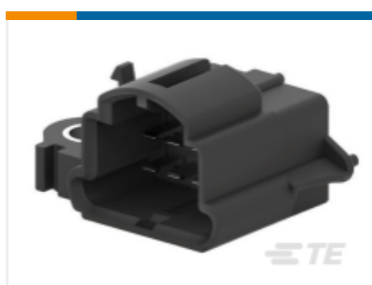
TE Part # CAT-LMPH9507 LOW & MEDIUM POWER HEADER