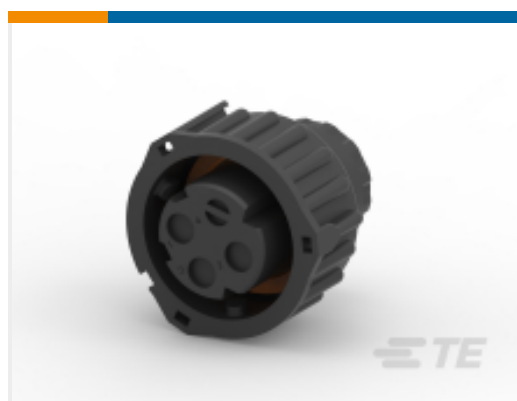
TE Part #1-967325-2 2,5MM BU-GEH 3P