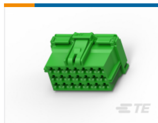
TE Part #1718490-2 AMP MCP, UNSEALED CONNECTOR HOUSING