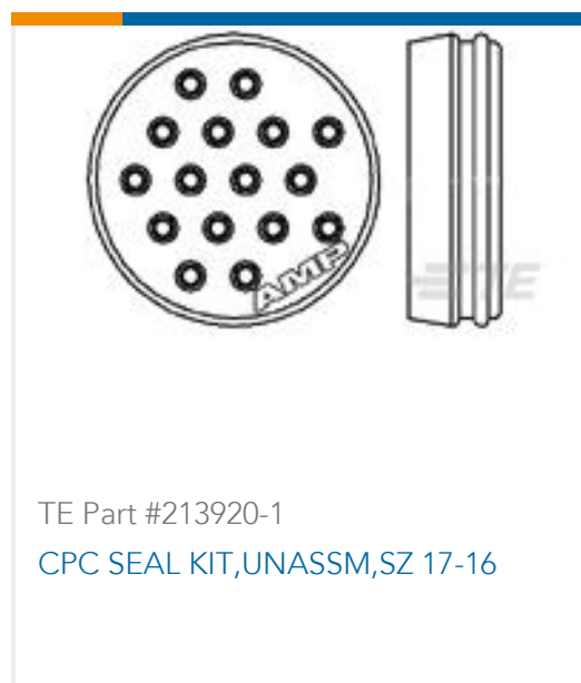
TE Part #213920-1 CPC SEAL KIT, UNASSM, SZ 17-16