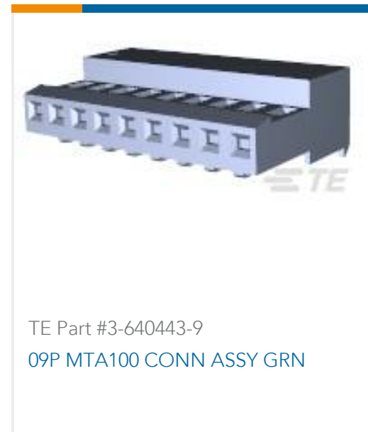
TE Part #3-640443-9 09P MTA100 CONN ASSY GRN