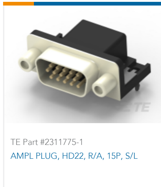
TE Part #2311775-1 AMPL PLUG, HD22, R/A, 15P, S/L