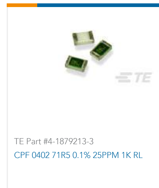
TE Part #4-1879213-3 CPF 0402 71R5 0.1% 25PPM 1K RL