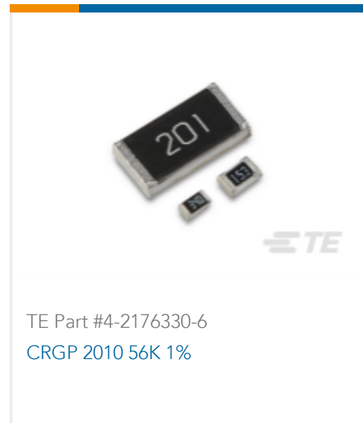
TE Part #4-2176330-6 CRGP 2010 56K 1%