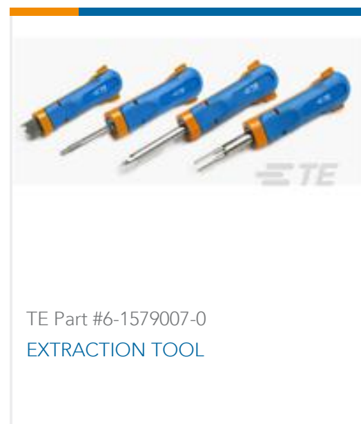
TE Part #6-1579007-0 EXTRACTION TOOL