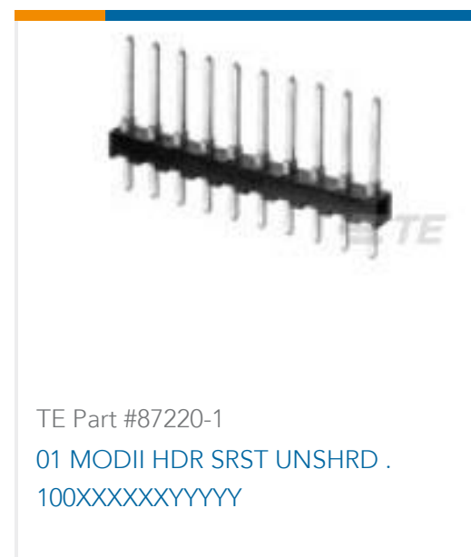
TE Part #87220-1 01 MODII HDR SRST UNSHRD . 100XXXXXXXXXXXX