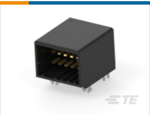
TE Part #1318126-1 Header Assembly: Wire-to-Board, 5A, gold plated