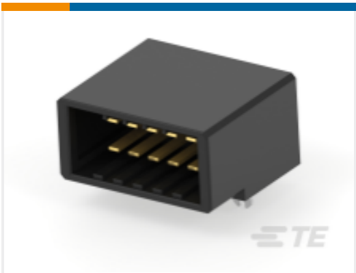
TE Part #1-178315-2 Header Assembly: Wire-to-Board, 15A, gold or tin plated