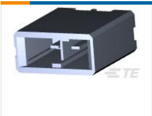
TE Part #2-917337-2 DYNAMIC D-3 VERTI. HDR ASSY 2P