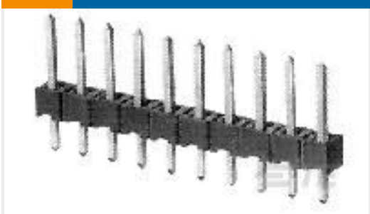
TE Part #1-826629-0 10P AMPMODU II STIFT LEI