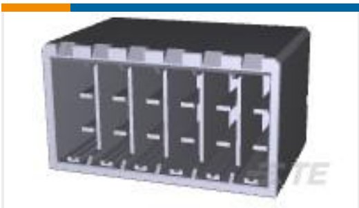
TE Part #316516-5 DYNAMIC 3500 HDR ASSY 12P V