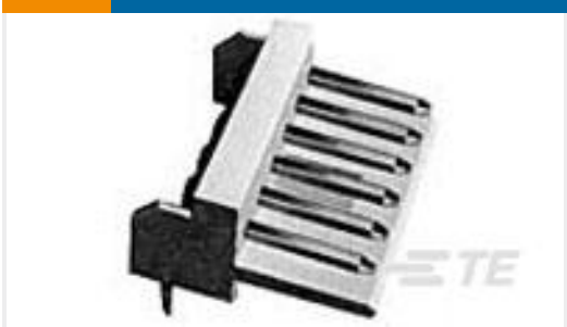
TE Part #171826-8 H-TYPE E.I.S.CONN. 8P ASSY