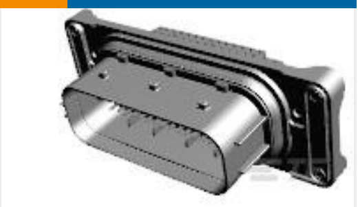
TE Part #1-1418362-3 62 POS MIXED HEADER CODA