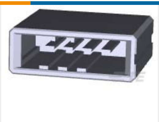
TE Part #2-178314-2 DYNAMIC D3100 HDR ASSY 4P V K/Y