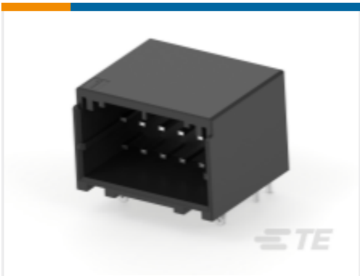
TE Part #2-1827875-3 Header Assembly: Wire-to-Board, 5A, gold or tin plated