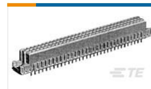
TE Part #5535043-4 ASSY,RECEPTACLE,EUROCARD,TYPE