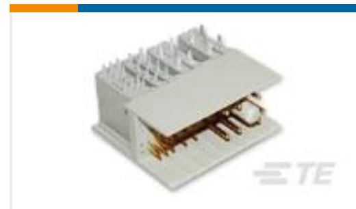
TE Part #1766500-1 Assembly, Right Angle, Advance