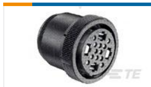
TE Part #206612-1 CPC PLUG ASSEMBLY SIZE 23-22