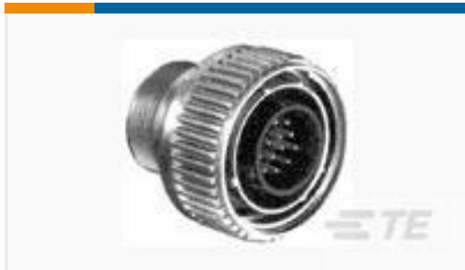
TE Part #208472-1 CMC PLUG ASSEMBLY, SZ 28