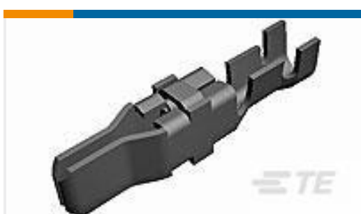
TE Part #66261-5 MALE CONTACT ASSY. (L.P.)