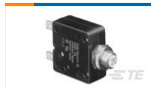
TE Part #4-1393249-5 W58-XC4C12A-3=W58