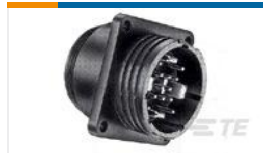
TE Part #206613-1 RECEPT ASSY, SZ 23-22, CPC