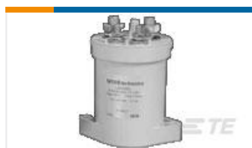
TE Part #5-1618388-4 LEV200A4ANF=RELAY, SPST-NO