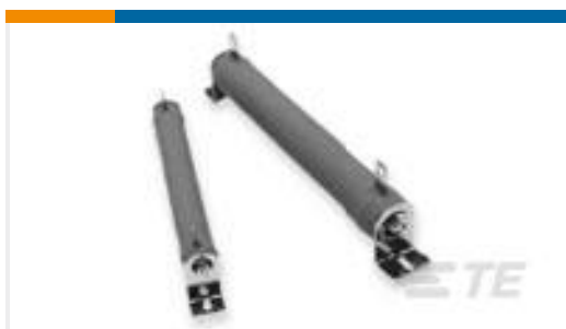
TE Part #1879447-2 TE 200W 1R2 5% Bracket