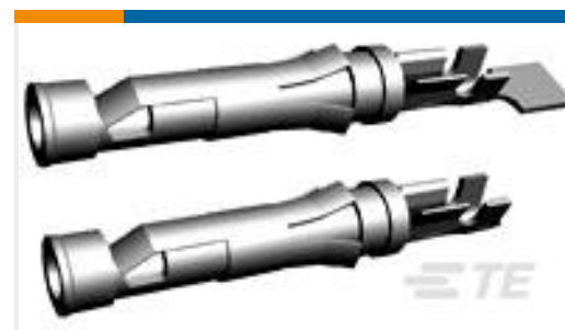
TE Part #66601-1 III+ SKT, 18-14, TIN-LEAD, LP