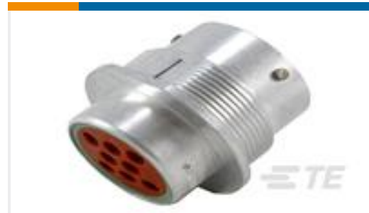
TE Part #HD34-18-8SN REC, 8P, AL, N, 12, S