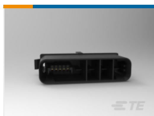
TE Part # 3-292187-2 PLUG ASS'Y OF HYB SF DRAWER9P