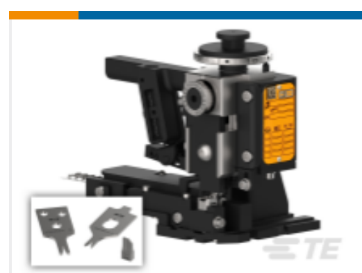
TE Part # 7-2151244-1 OCEAN_2.0_Applicator-S-085F120F