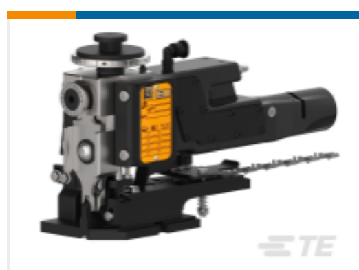
TE Part # 2151244-2 OCEAN_2.0_Applicator-S-085F120F