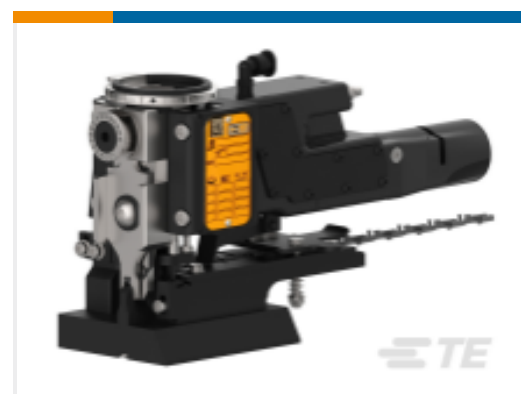
TE Part # 2-2151244-2 OCEAN_2.0_Applicator-S-085F120F