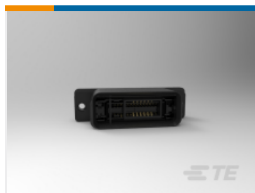
TE Part # 2-292181-8 PLUG ASS'Y OF HYB DRAWER 32P