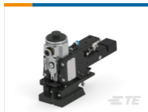
TE Part # 2151244-1 OCEAN_2.0_Applicator-S-085F120F