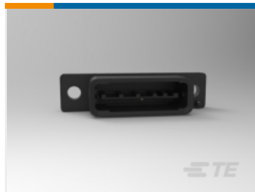
TE Part # CAT-AM7053-D797P Mini CT Drawer Connector Assemblies