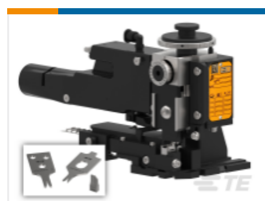
TE Part # 7-2151244-2 OCEAN_2.0_Applicator-S-085F120F