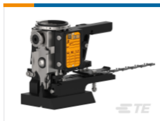
TE Part # 2-2151244-1 OCEAN_2.0_Applicator-S-085F120F