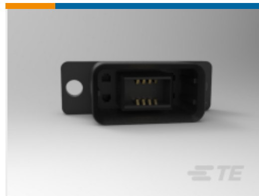
TE Part # 292182-8 PLUG ASS'Y OF HYB DRAWER 12P