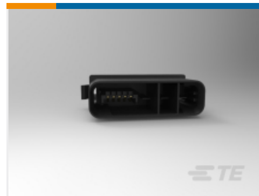
TE Part # 1-292187-2 PLUG ASS'Y OF HYB SF DRAWER8P