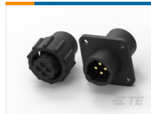
TE Part # CAT-AM71-C83998J CPC SERIES 1