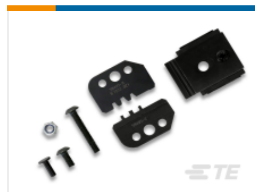
TE Part # 58495-2 PROCRIMPER DIE ASSY MULTIMATE