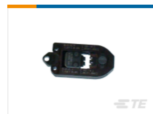
TE Part # 91515-3 CCII TYPE III+ MNL PIN SKT 30-20 HEAD