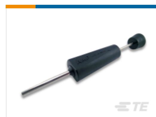
TE Part # 305183 EXTRACT TOOL TYPE 2 20-16