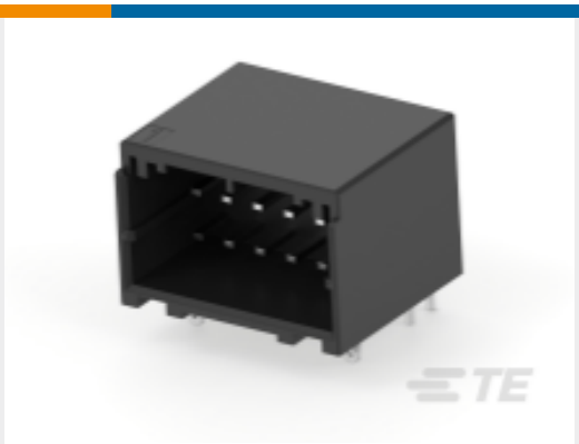
TE Part #1-1827876-3 Header Assembly: Wire-to-Board, 5A, gold or tin plated