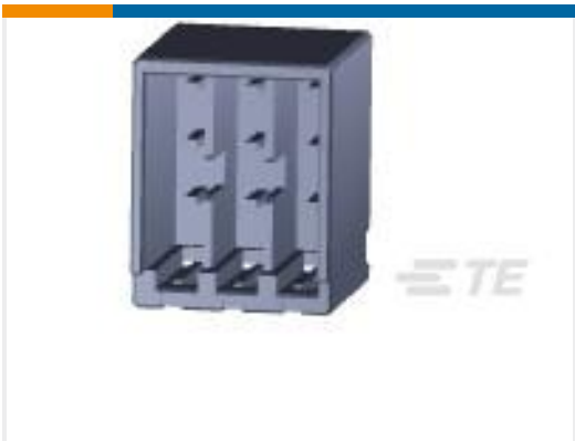
TE Part #1-1827581-3 DYNAMIC 1500T HDR ASSY V 9P X BLACK GOLD