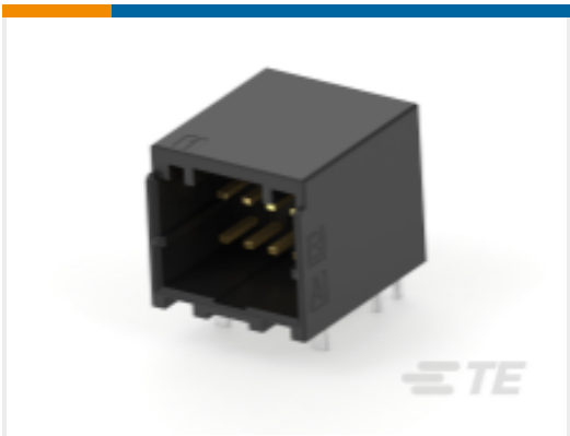
TE Part #1-1827872-3 Header Assembly: Wire-to-Board, 3A, gold or Tin plated