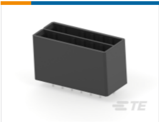
TE Part #1-917337-2 Header Assembly: Wire-to-Board, 15A, gold or tin plated