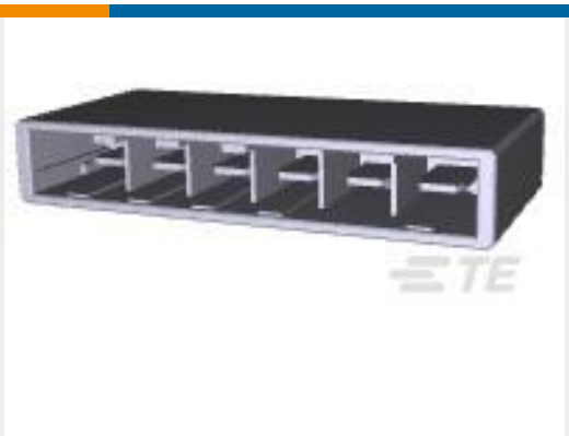
TE Part #6-179960-2 D5 V-HDR ASSY 6P TAIL LENGTH 4