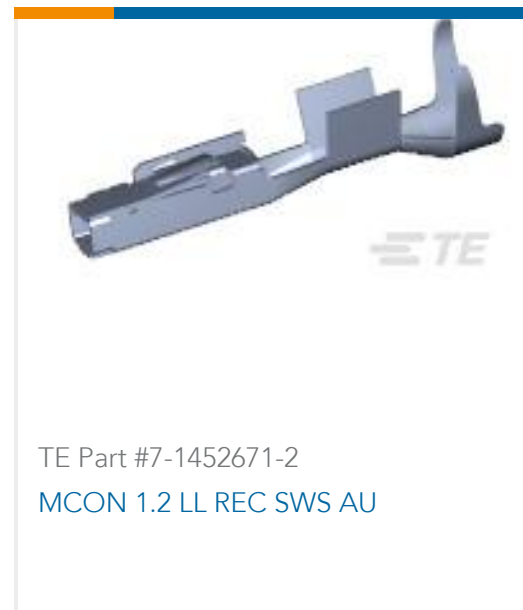
TE Part #7-1452671-2 MCON 1.2 LL REC SWS AU