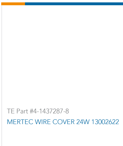
TE Part #4-1437287-8 MERTEC WIRE COVER 24W 13002622