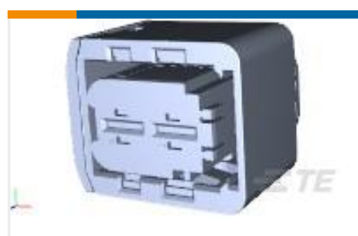
TE Part #1-1564542-1 2POS,AMP MCP6.3/4.8K,REC HSG,A