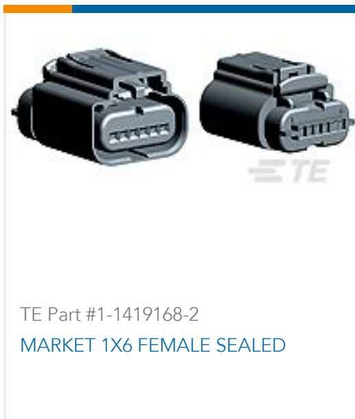
TE Part #1-1419168-2 MARKET 1X6 FEMALE SEALED