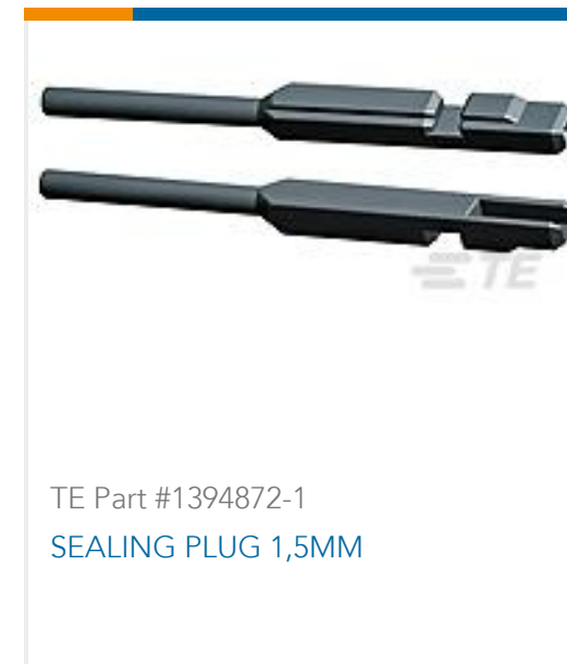
TE Part #1394872-1 SEALING PLUG 1,5MM