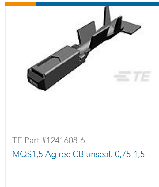
TE Part #1241608-6 MQS1,5 Ag rec CB unseal. 0,75-1,5