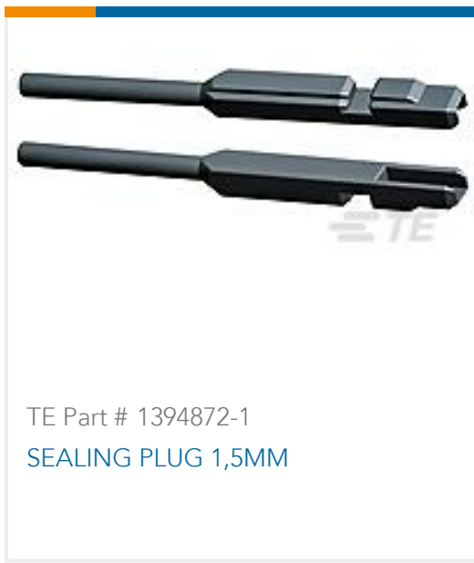
TE Part # 1394872-1 SEALING PLUG 1,5MM