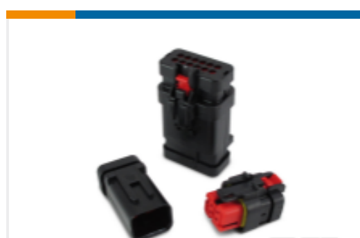
TE Part #2040594-5 AMPSEAL 16 HOUSINGS