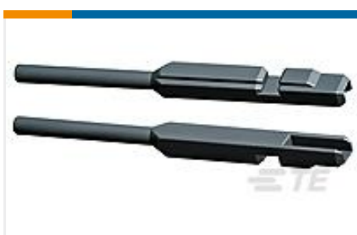
TE Part #1394871-1 MQS DICHTSTOPFEN