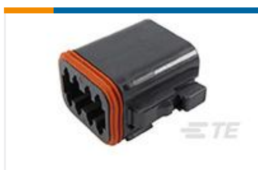
TE Part #DT06-08SB-C015 PLG, 8P, BLK, E, B