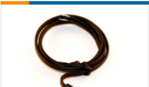
TE Part #GA10K3435STM010 PRO4-OVERMOLDED PROBE

Product Drawings DYNAMIC D3100 HDR ASSY 6P H K/X English