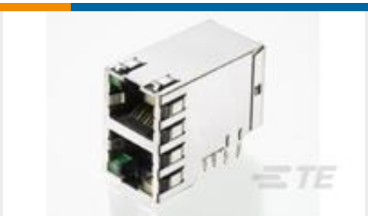
TE Part #1888653-3 2X1 OFFSET ST/JK WITH LEDS