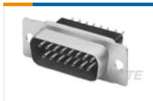
TE Part #745414-1 50 PLUG SP/MS STD