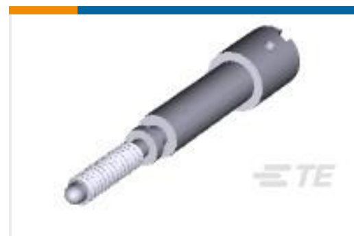
TE Part #203618-1 MALE J.S. ASSY. - SHORT