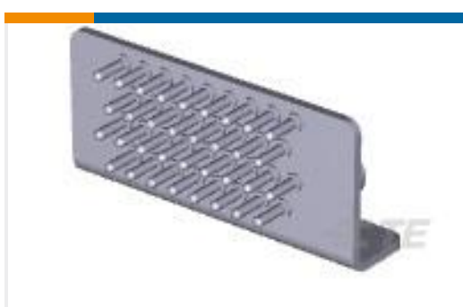
TE Part #204814-1 GROUNDING CONN. 34 POS. ASY.