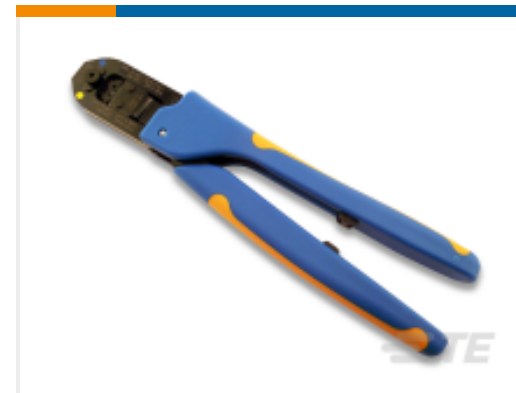
TE Part # 91505-1 CCII TYPE III+ 24-16 ASSY