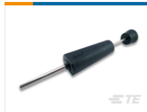
TE Part # 305183 EXTRACT TOOL TYPE 2 20-16