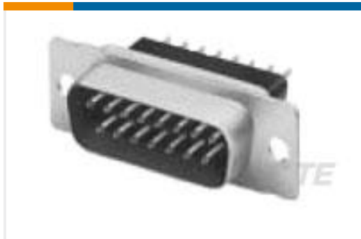
TE Part #5745413-1 37 PLUG SP/MS STD