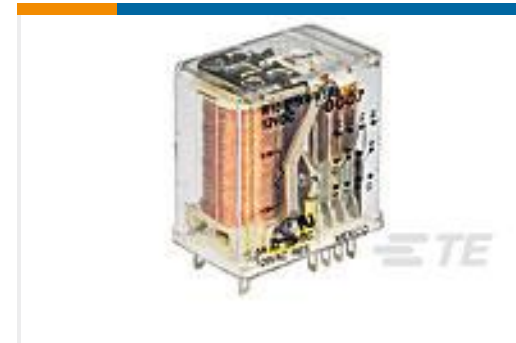
TE Part #1393766-9 R10-E1X2-V700=R10