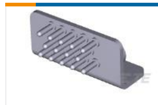
TE Part #203540-1 GROUNDING CONN,14 POS