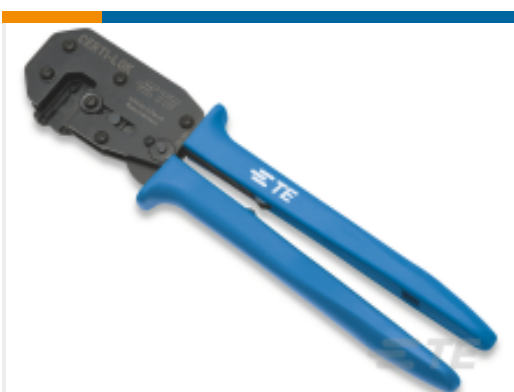
TE Part # 169400 CERTI-LOK