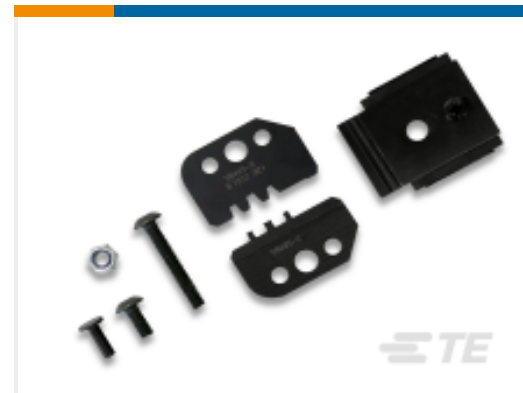
TE Part # 58495-2 PROCRIMPER DIE ASSY MULTIMATE