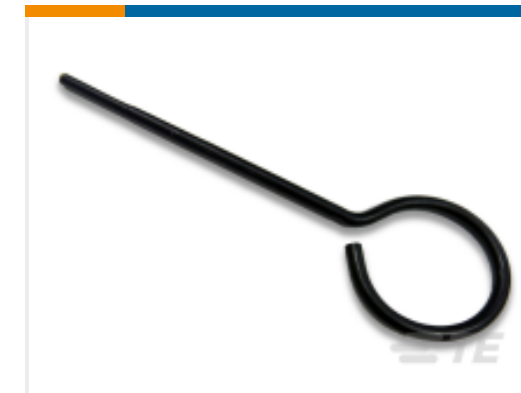
TE Part # 200893-2 INSERTION TOOL CONT