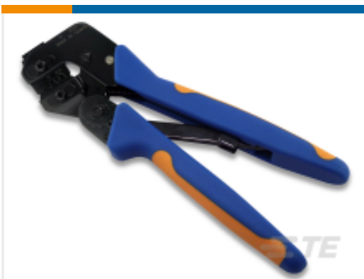
TE Part # 58495-1 PRO CRIMPER ASSY MULTIMATE