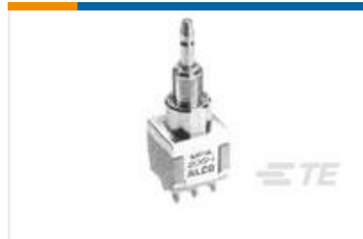
TE Part #3-1437567-3 MPA206R=SW P/B MOM DPDT