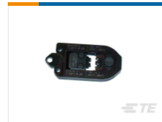
TE Part # 91515-3 CCII TYPE III+ MNL PIN SKT 30-20 HEAD