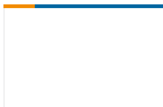
TE Part #DT06-3S-KIT 3WY PL W/WEG