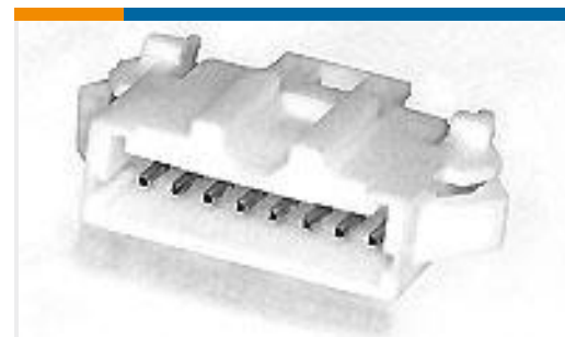
TE Part #1-292215-6 MINI CT SGL RELAY 16P NAT