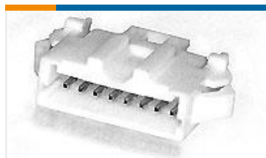
TE Part #292215-6 MINI CT SGL RELAY 6P NAT