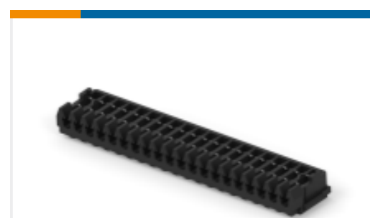
TE Part #4-353293-0 1.5MM CT MT REC ASSY 20P BLACK