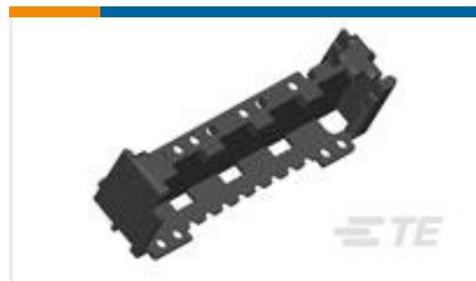
TE Part #3-179472-0 CT DBL ROW HOLDER,CRIMP,30P,NA