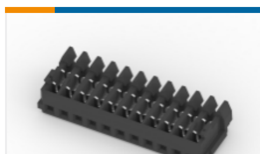
TE Part #3-353293-1 1.5MM CT MT REC ASSY 11P BLACK