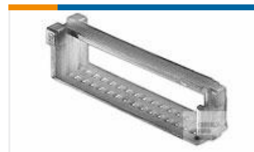
TE Part #3-353294-4 AMP MINI D/R HDR HSG 34P NATU