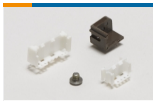
PCB Connector Mounting(46)