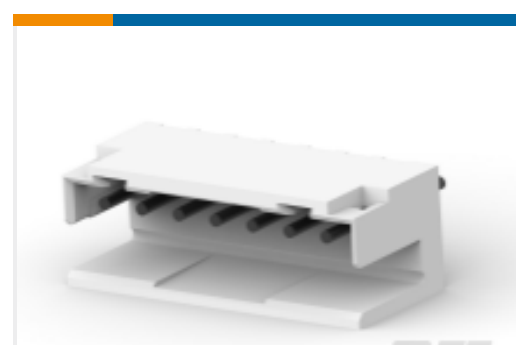
TE Part #292254-4 AMP COMMON TERMINATION HEADERS