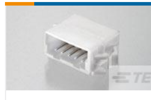
TE Part #292254-5 CT RELAY HDR ASSY 5P NAT