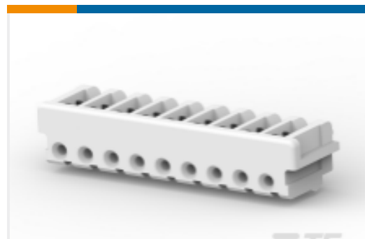
TE Part #1-173977-2 AMP COMMON TERMINATION HOUSINGS