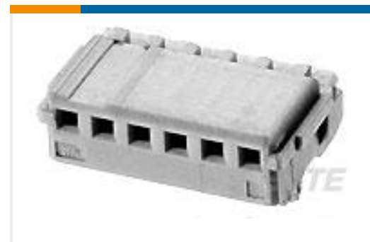
TE Part #1-353908-7 CT REC HSG 17P CRIMP TYPE WHIT