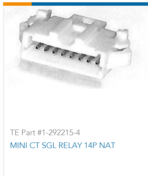
TE Part #1-292215-4 MINI CT SGL RELAY 14P NAT