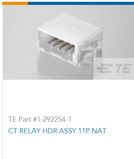
TE Part #1-292254-1 CT RELAY HDR ASSY 11P NAT