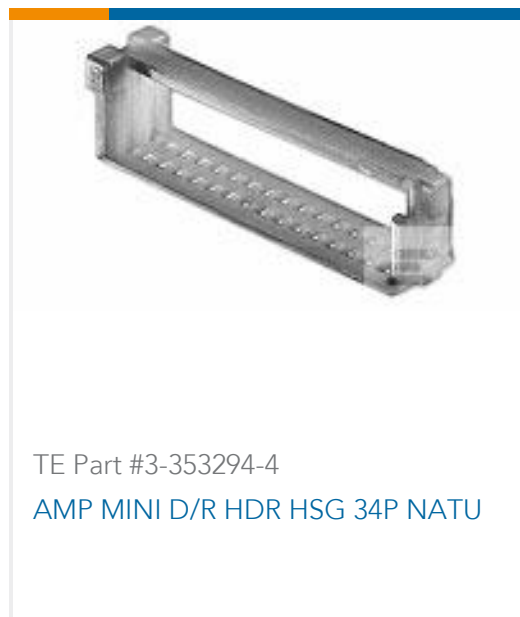
TE Part #3-353294-4 AMP MINI D/R HDR HSG 34P NATU