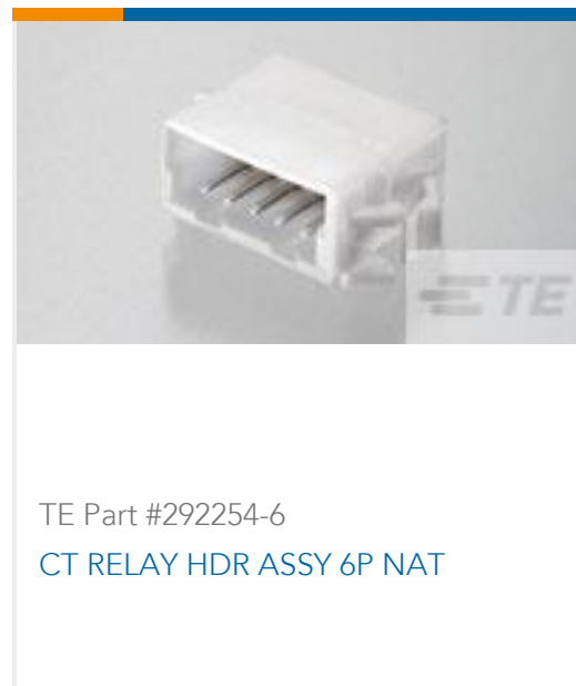
TE Part #292254-6 CT RELAY HDR ASSY 6P NAT