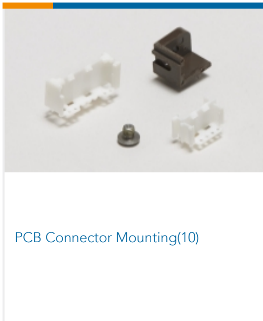
PCB Connector Mounting(10)