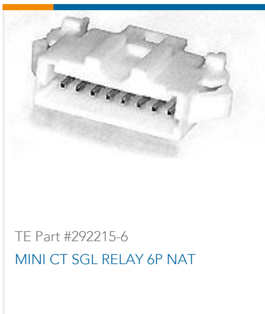
TE Part #292215-6 MINI CT SGL RELAY 6P NAT