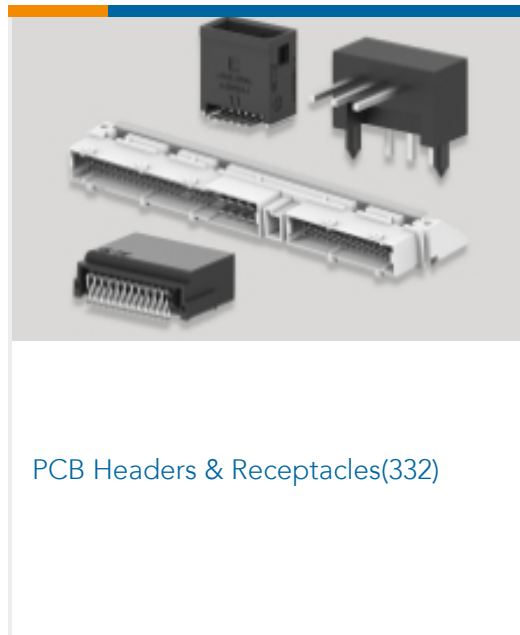
PCB Headers & Receptacles(332)