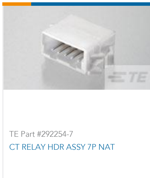
TE Part #292254-7 CT RELAY HDR ASSY 7P NAT