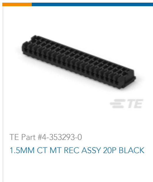
TE Part #4-353293-0 1.5MM CT MT REC ASSY 20P BLACK