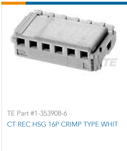
TE Part #1-353908-6 CT REC HSG 16P CRIMP TYPE WHIT