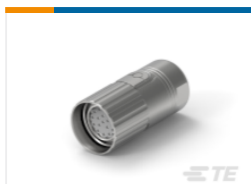
TE Part #ASA035N00610235000 623 PLUG