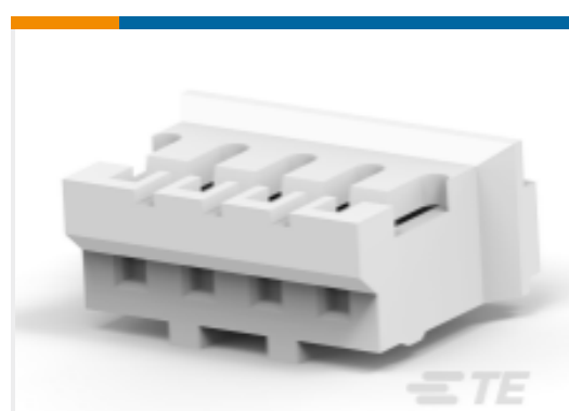
TE Part #440129-6 AMP HPI 2.0MM RECEPTACLE HOUSINGS