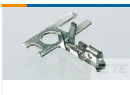
TE Part #1735801-1 2.0mm,Crimp,Contact