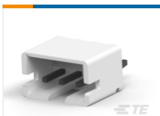
TE Part #1-440054-0 AMP HPI 2.0MM HEADERS