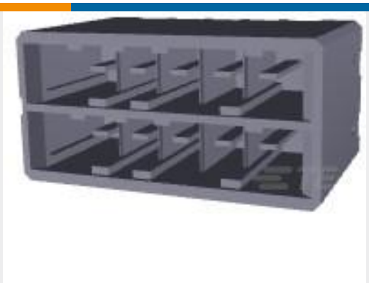
TE Part #1-917657-3 DYNAMIC D-3200M HDR ASSY 10P V