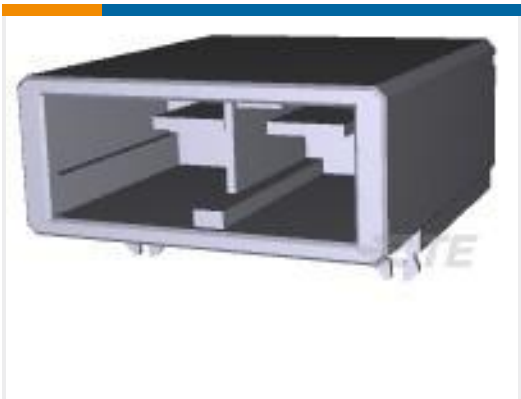
TE Part #1-353079-2 DYNAMIC D-5200 HDR H ASSY 2P