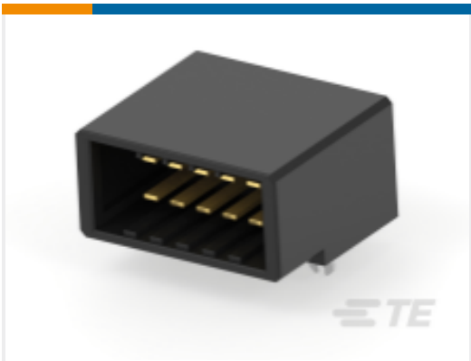
TE Part #2-178313-3 Header Assembly: Wire-to-Board, 15A, gold or tin plated