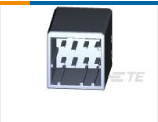
TE Part #1318125-1 DYNAMIC D2100 HDR V ASSY 8P