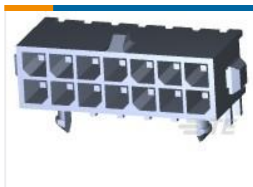
TE Part #4-794619-4 14P MICRO MNL ASSY,R/A,HDR LF