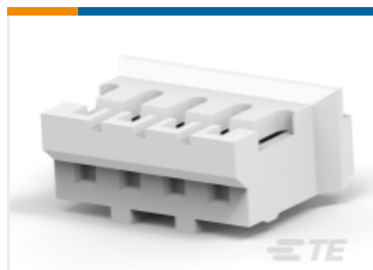
TE Part #1-440129-4 AMP HPI 2.0MM RECEPTACLE HOUSINGS