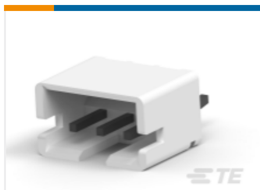
TE Part #1-440054-0 AMP HPI 2.0MM HEADERS