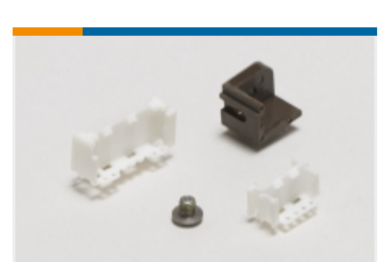
PCB Connector Mounting(8)