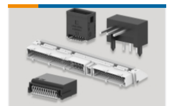
PCB Headers & Receptacles(283)