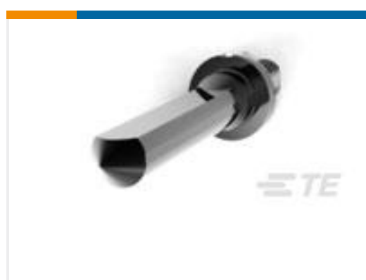
TE Part # 1-1410773-3 MULTIGIG RT BP GUIDE PIN 4.2 NI