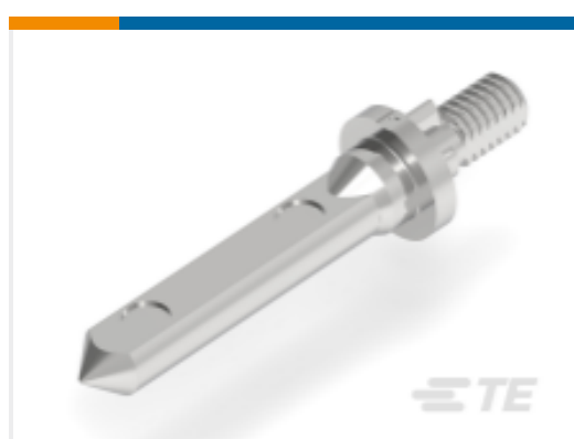
TE Part # 1-1410773-2 MULTIGIG RT BP GUIDE PIN 2.5 NI