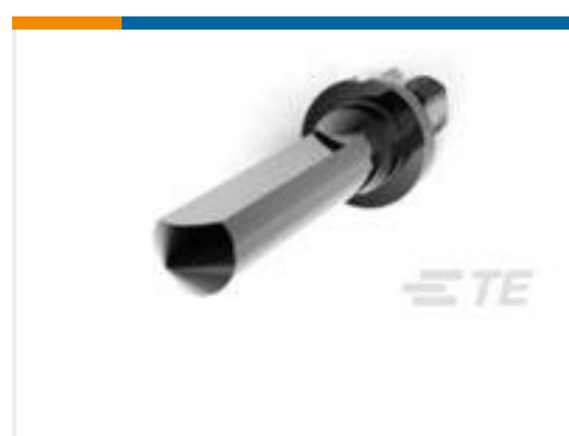
TE Part # 1-1410773-4 MULTIGIG RT BP GUIDE PIN 5.7 NI