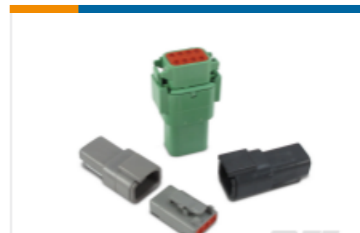
TE Part #DTM06-08SA-EE04 DEUTSCH DTM HOUSINGS