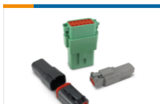
TE Part #DT06-08SA-E003 DEUTSCH DT Series Housings & Connectors