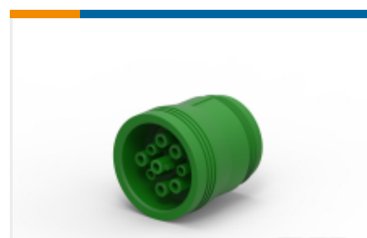
TE Part #HD17-9-1939S-P080 PLUG ASM