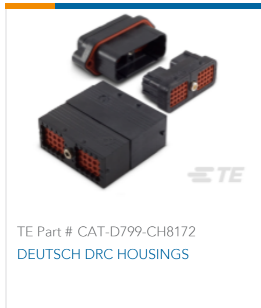
TE Part # CAT-D799-CH8172 DEUTSCH DRC HOUSINGS