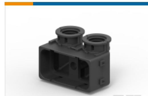
TE Part #0528-001-5005 BKSHL, 50P, BLK, PLG, RA, NW 17