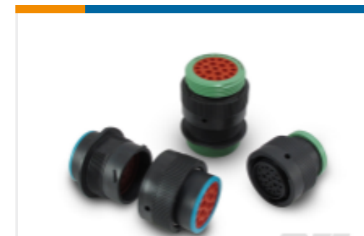
TE Part #HDP24-24-9PE DEUTSCH HDP20 HOUSINGS