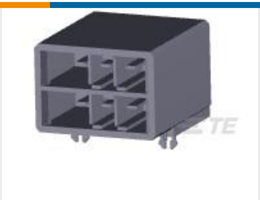
TE Part #1-178139-5 DYNAMIC 3200 HDR H 6P ASSY