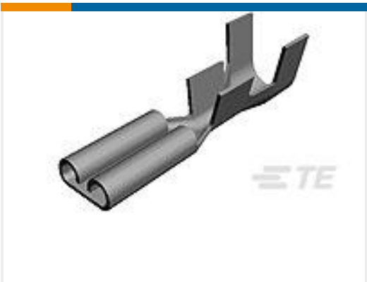
TE Part #170048-2 110 FASTON, REC., 24-20 AWG, TPBR