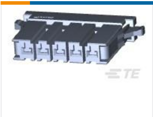
TE Part #1-178128-5 DYNAMIC 3200 REC HSG 5P X