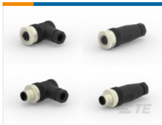
TE Part #T4113401021-000 M12 Field Installable Unshielded