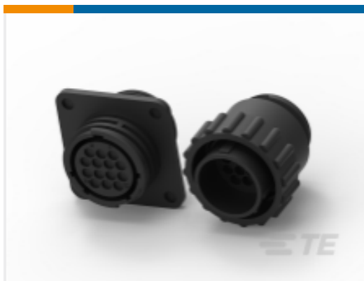
TE Part #206708-1 CPC SERIES 6