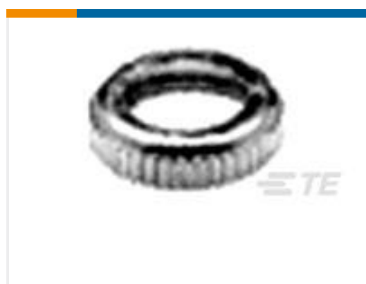
TE Part #1825622-2 N1B04=Nut Decorative