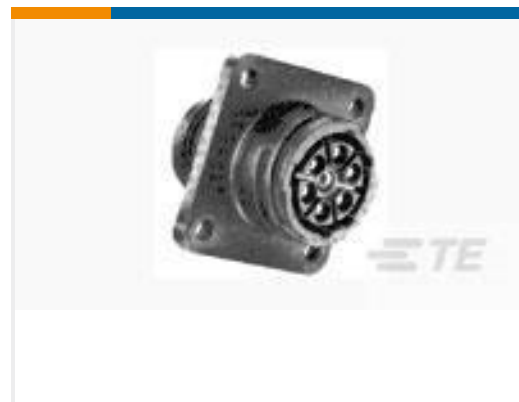
TE Part #211398-2 CPC RECPT. SIZE 13-7