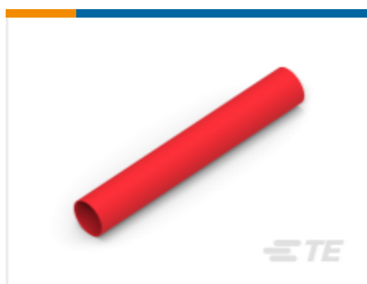
TE Part #NB14534001 VERSAFIT-3/8-2-SP