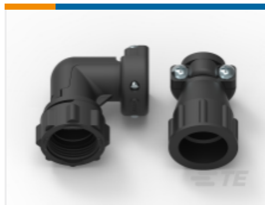
TE Part #206070-8 CPC CABLE CLAMPS