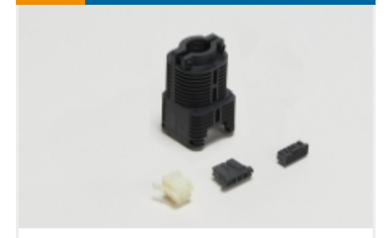
Rectangular Connector Housings(2)