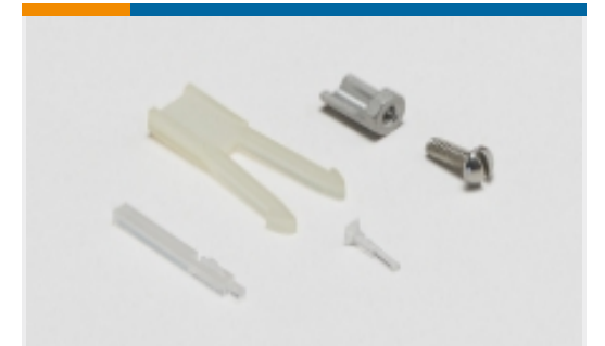
PCB Connector Keying(1)