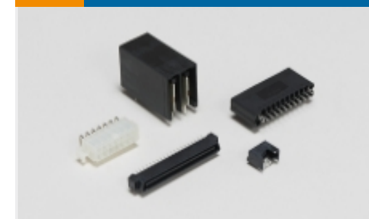
Standard Rectangular Connectors(1)