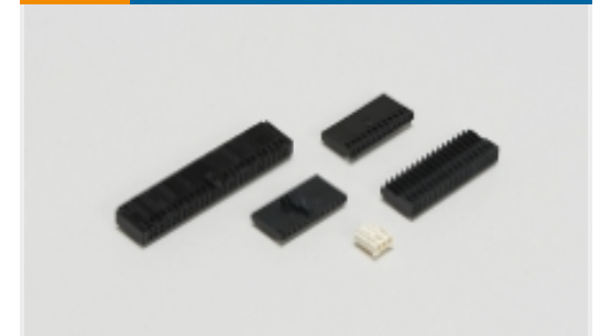
Wire-to-Board Connector Assemblies & Housings(157)