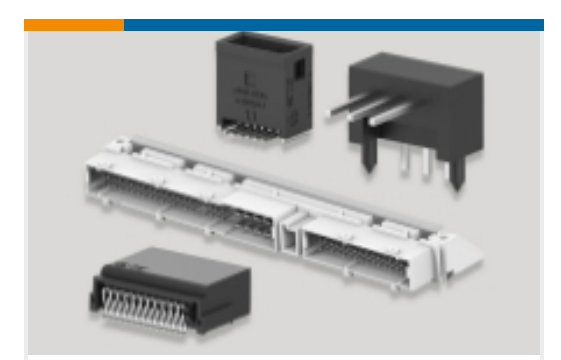
PCB Headers & Receptacles(171)