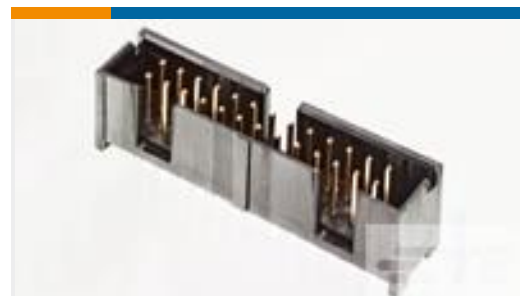
TE Part #5103309-5 A/L LOW PRO HDR 20P VERT BLACK