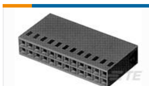
TE Part #925367-5 MOD 4 REC.HSG 2X05P