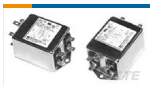
TE Part #6609066-1 3AYO1=F7691 S0