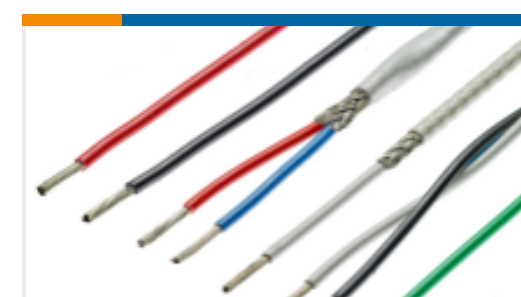
TE Part #2616073005 44M9976-20-0