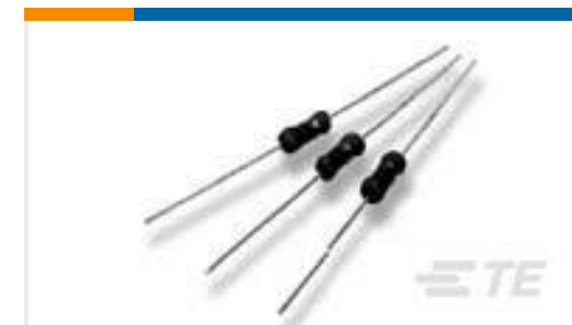
TE Part #1625886-8 1W SM M/OX 5% 390K