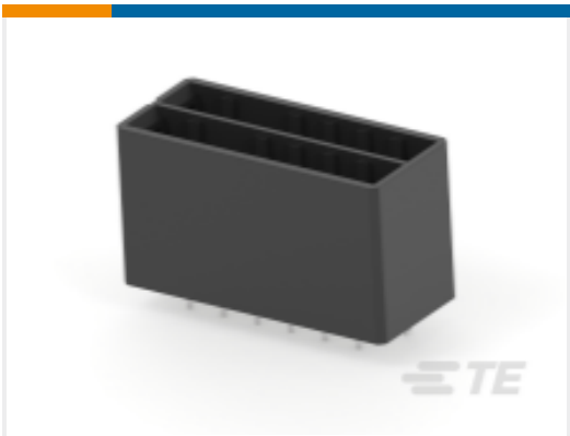
TE Part #3-178139-2 Header Assembly: Wire-to-Board, 15A, gold or tin plated