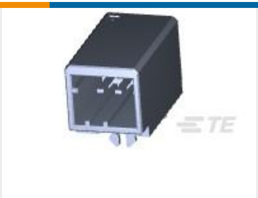
TE Part #1376135-2 DYNAMIC D2100 HDR H ASSY 3P Y