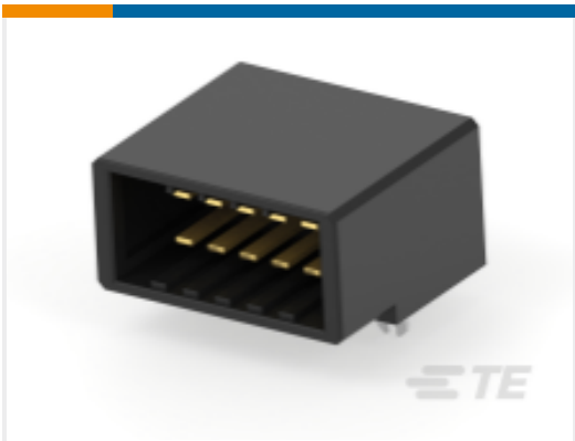
TE Part #1-178315-2 Header Assembly: Wire-to-Board, 15A, gold or tin plated