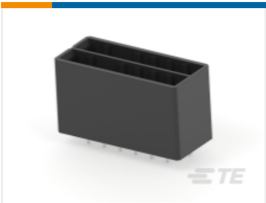
TE Part #2-178136-2 Header Assembly: Wire-to-Board, 15A, gold or tin plated