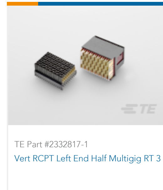
TE Part #2332817-1 Vert RCPT Left End Half Multigig RT 3