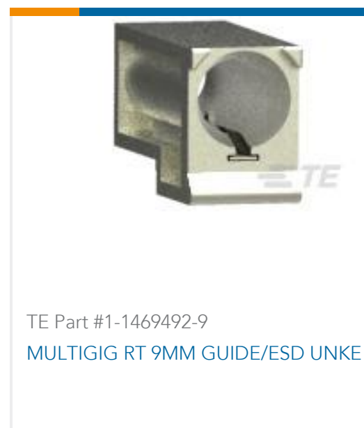
TE Part #1-1469492-9 MULTIGIG RT 9MM GUIDE/ESD UNKE