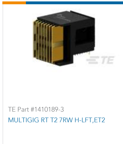
TE Part #1410189-3 MULTIGIG RT T2 7RW H-LFT, ET2