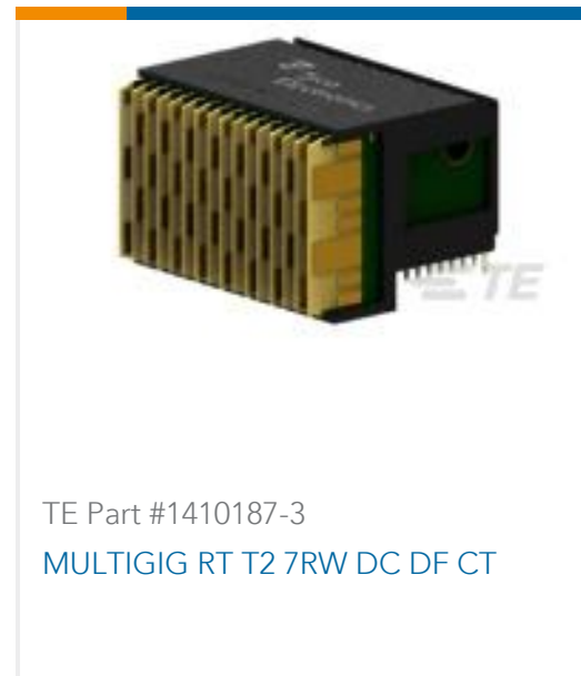
TE Part #1410187-3 MULTIGIG RT T2 7RW DC DF CT