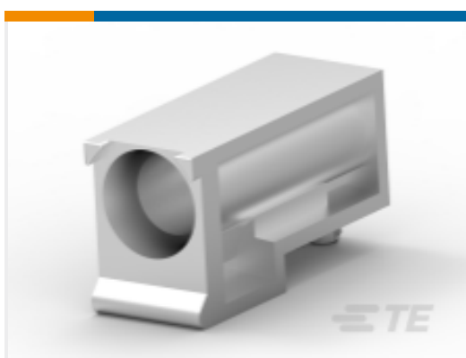
TE Part # 1-1469492-9 MULTIGIG RT 9MM GUIDE/ESD UNKE