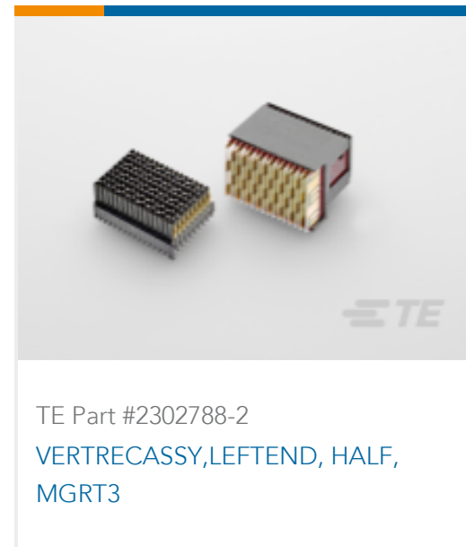
TE Part #2302788-2 VERTRECCASSY, LEFTEND, HALF, MGRT3