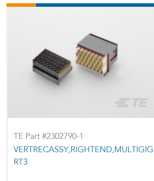
TE Part #2302790-1 VERTRECCASSY, RIGHTEND, MULTIGIG RT3