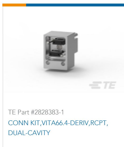
TE Part #2828383-1 CONN KIT, VITA66.4-DERIV, RCPT, DUAL-CAVITY