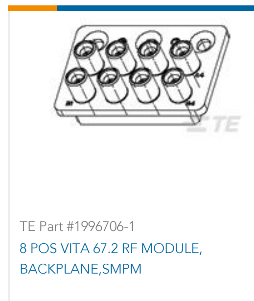
TE Part #1996706-1 8 POS VITA 67.2 RF MODULE, BACKPLANE, SMPM