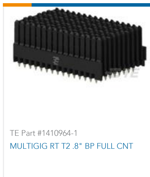
TE Part #1410964-1 MULTIGIG RT T2 .8" BP FULL CNT