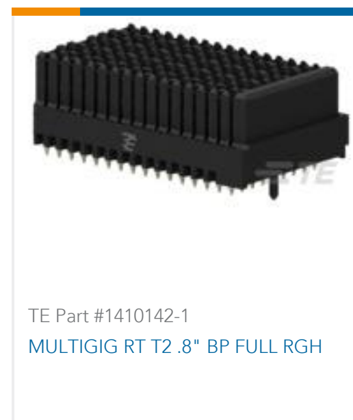
TE Part #1410142-1 MULTIGIG RT T2 .8" BP FULL RGH