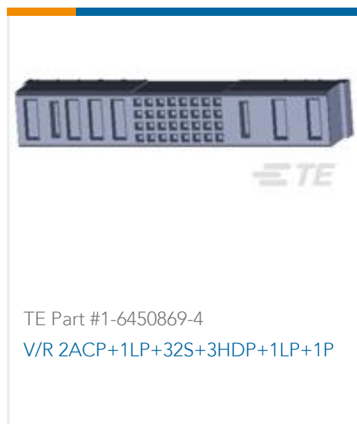
TE Part #1-6450869-4 V/R 2ACP+1LP+32S+3HDP+1LP+1P