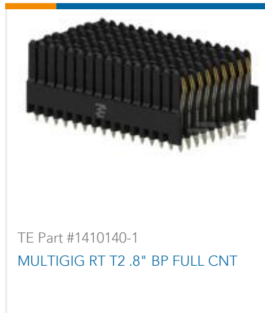
TE Part #1410140-1 MULTIGIG RT T2 .8" BP FULL CNT