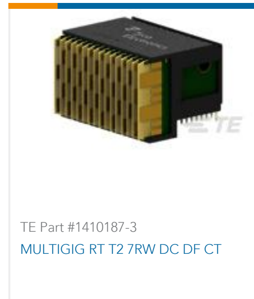
TE Part #1410187-3 MULTIGIG RT T2 7RW DC DF CT