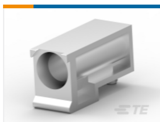
TE Part # 1-1469492-9 MULTIGIG RT 9MM GUIDE/ESD UNKE