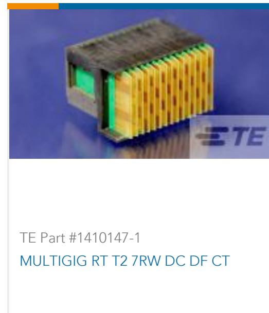
TE Part #1410147-1 MULTIGIG RT T2 7RW DC DF CT