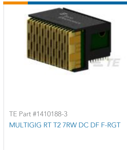
TE Part #1410188-3 MULTIGIG RT T2 7RW DC DF F-RGT