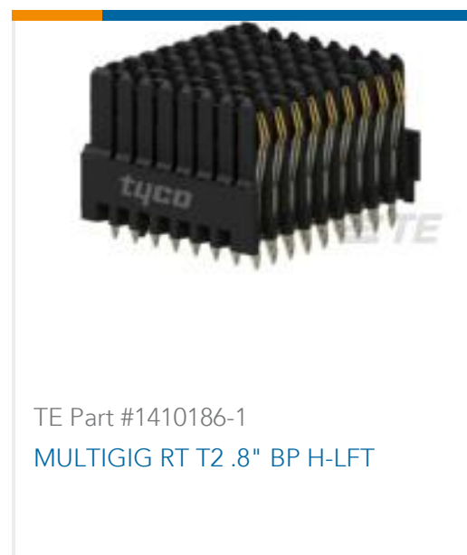
TE Part #1410186-1 MULTIGIG RT T2 .8" BP H-LFT