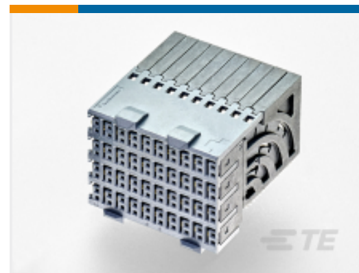
TE Part #2170903-1 RECEPTACLE HM-EZD+, 4PAIRS 10COLUMNS