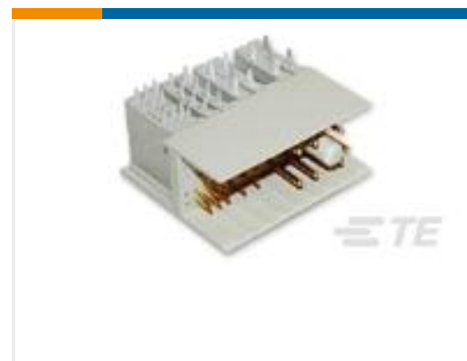
TE Part #1766500-1 Assembly, Right Angle, Advance