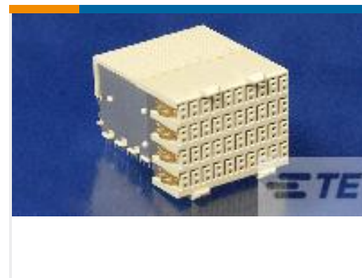
TE Part #2065657-1 zd Plus, 4 pair, receptacle assy