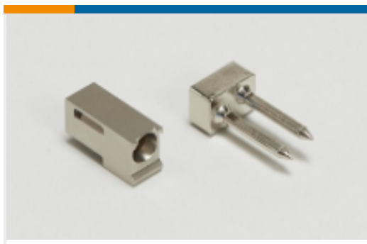
Backplane Guide Hardware(4)