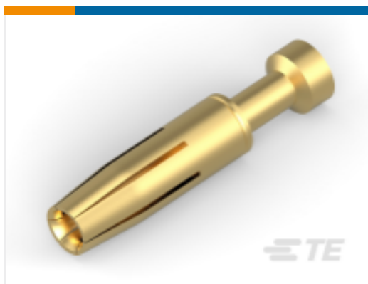
TE Part #T2030012010-000 DEF-1.0