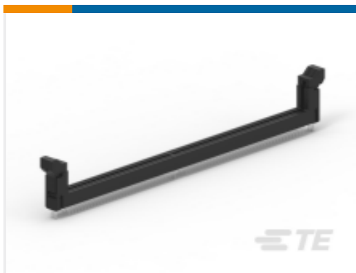
TE Part #2308107-1 DDR4 DIMM 288 PIN TH TYPE