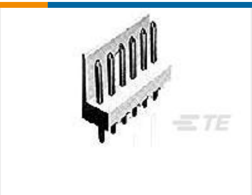
TE Part #173081-2 EIS POST ASSY V 2P GOLD NATU.