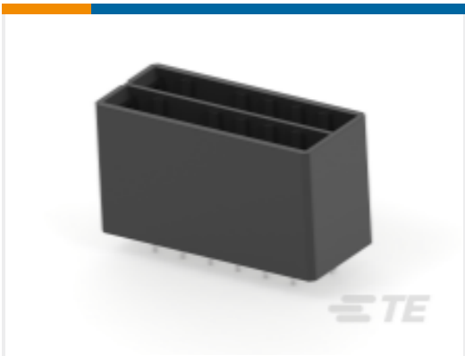
TE Part #1-917337-5 Header Assembly: Wire-to-Board, 15A, gold or tin plated