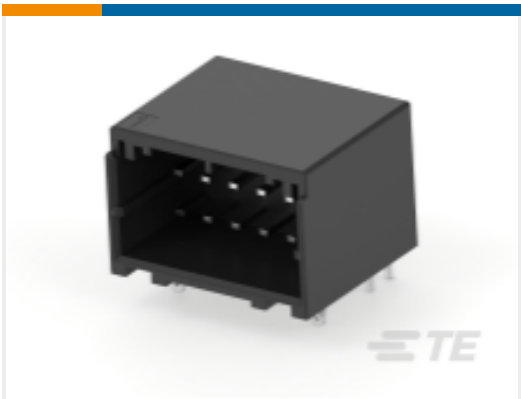
TE Part #1-1827875-3 Header Assembly: Wire-to-Board, 5A, gold or tin plated