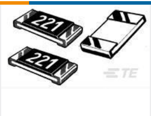
TE Part #9-2176070-8 3521 110K 1% 2W