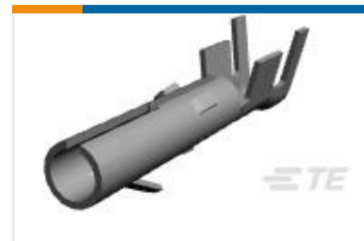
TE Part #163302-8 MATENLOK SOCKET