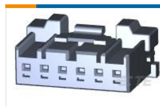
TE Part #1-1747066-6 GRACE INERTIA CONN 2.5 PLUG HSG 6P RED