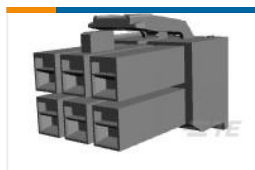
TE Part #176274-6 AMP UNIVERSAL POWER PLUG 6P