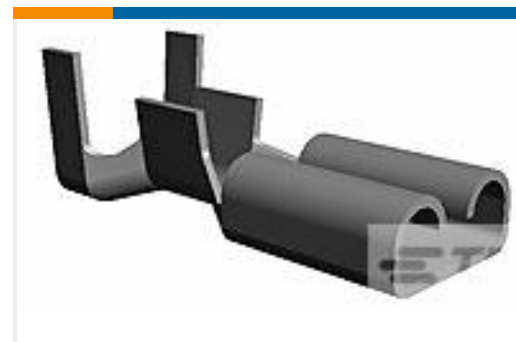
TE Part #62138-1 187 FASTON REC 24-20 TPBR