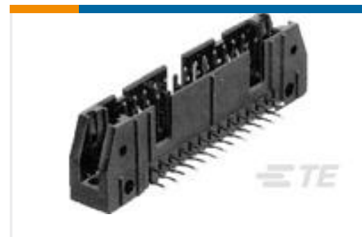
TE Part #5102160-6 A/L UNIV HDR 26P RA