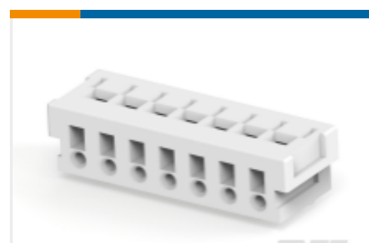
TE Part #175778-7 CT. CRIMP REC HSG 7P