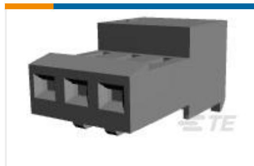
TE Part #3-641534-3 03P MTA100 CONN ASSY LF