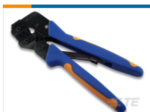
TE Part # 58495-1 PRO CRIMPER ASSY MULTIMATE