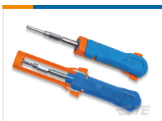
TE Part # 539972-1 EXTRACTION TOOL