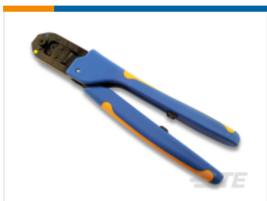
TE Part # 91505-1 CCII TYPE III+ 24-16 ASSY