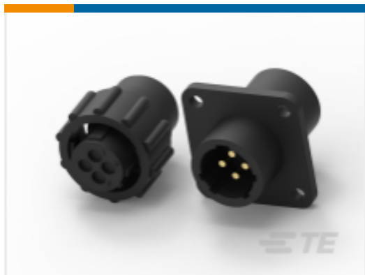
TE Part # CAT-AM71-C83998J CPC SERIES 1