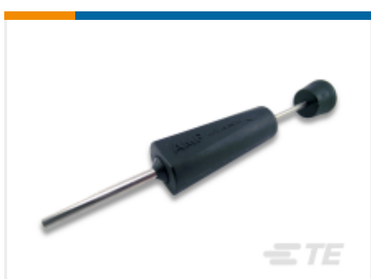
TE Part # 305183 EXTRACT TOOL TYPE 2 20-16