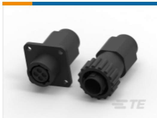
TE Part # CAT-AM71-C83998Y CPC SERIES 1 SEALED ONE-PIECE