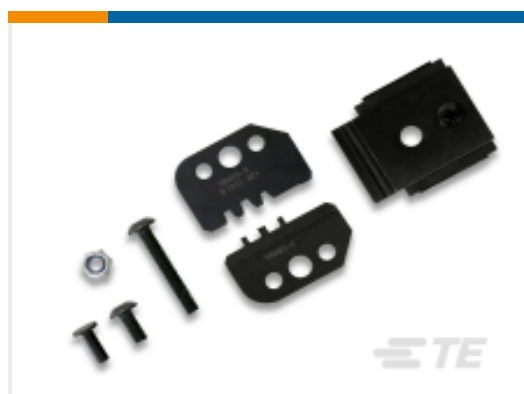
TE Part # 58495-2 PROCRIMPER DIE ASSY MULTIMATE