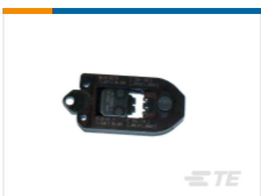
TE Part # 91515-3 CCII TYPE III+ MNL PIN SKT 30-20 HEAD