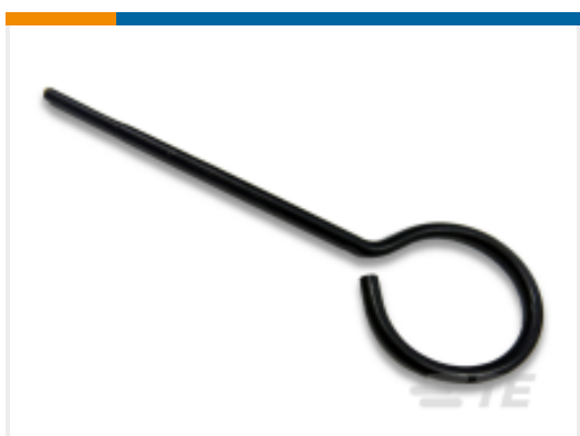
TE Part # 200893-2 INSERTION TOOL CONT