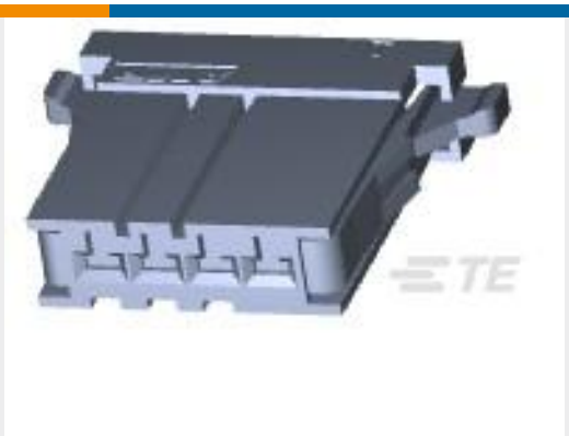
TE Part #1-178288-4 DYNAMIC 3100 REC HSG 4P