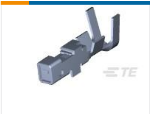
TE Part #1827571-2 DYNAMIC D1000 REC CONT L AU 0.38 um FORM