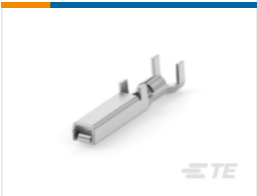
TE Part #1-175195-5 Contact: Component To Wire; 15A, 28-14 wire size