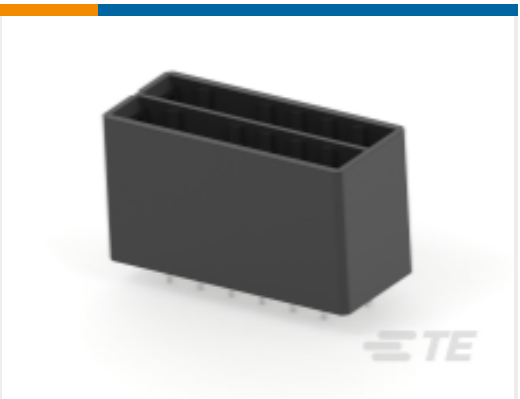
TE Part #1-178136-5 Header Assembly: Wire-to-Board, 15A, gold or tin plated