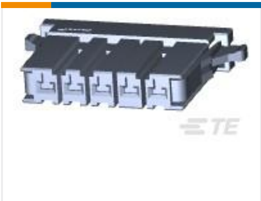
TE Part #1-178128-5 DYNAMIC 3200 REC HSG 5P X