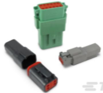
TE Part # CAT-D487-CH8172 DEUTSCH DT Series Housings & Connectors