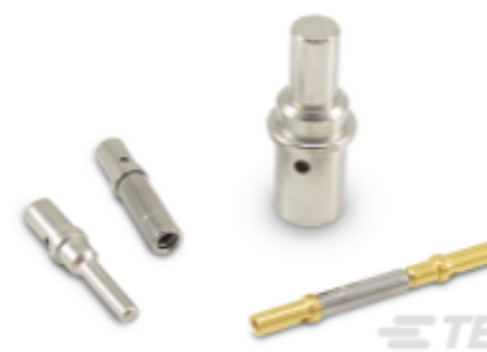
TE Part # CAT-D48-ST273 DEUTSCH SOLID CONTACTS