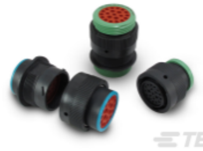
TE Part # CAT-H396-CH8172 DEUTSCH HDP20 HOUSINGS