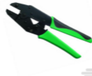
TE Part # HDT-50-00 CRIMP TOOL