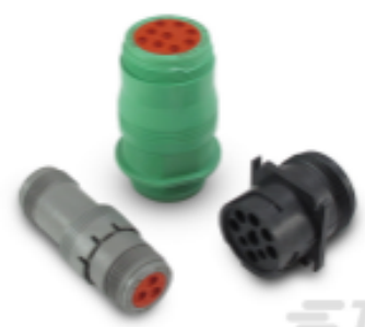
TE Part # CAT-H3910-CH8172 DEUTSCH HD10 HOUSINGS