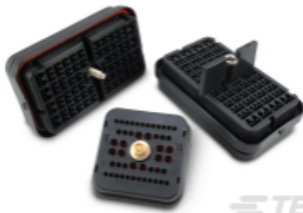
TE Part # CAT-D781-CH8172 DEUTSCH DRB HOUSINGS