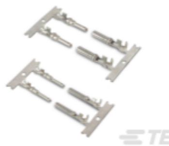
TE Part # CAT-D48-SFT273 DEUTSCH STAMPED & FORMED CONTACTS