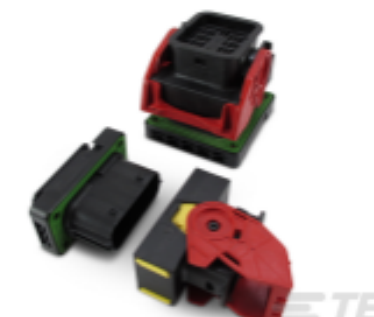
TE Part # CAT-ST858-CH8172 DEUTSCH STRIKE HOUSINGS