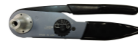
TE Part # HDT-48-00 CRIMP TOOL, HAND