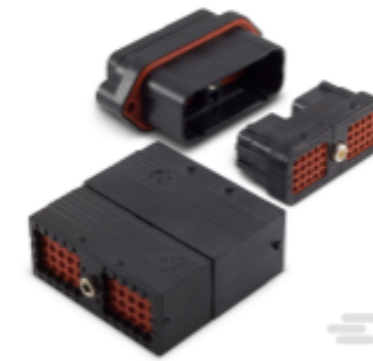
TE Part # CAT-D799-CH8172 DEUTSCH DRC HOUSINGS