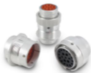
TE Part # CAT-H3930-CH8172 DEUTSCH HD30 HOUSINGS